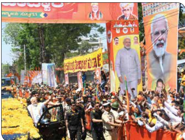
PM Shri Narendra Modi receives grand welcome on his arrival at Mandya in Karnataka on March 12, 2023