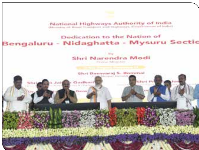
PM Shri Narendra Modi lays foundation stone and dedicates key development projects at Mandya in Karnataka on March 12, 2023