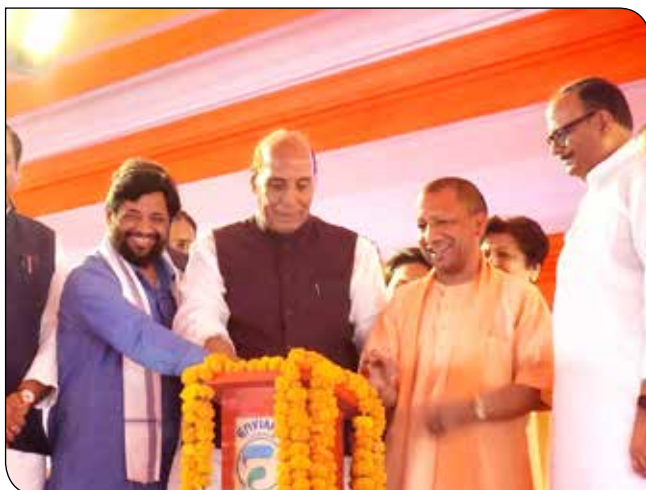
Defence Minister Shri Rajnath Singh along with Uttar Pradesh Chief Minister Yogi Adityanath inaugurating and laying the foundation stone for 350 development projects in Lucknow on March 18, 2023