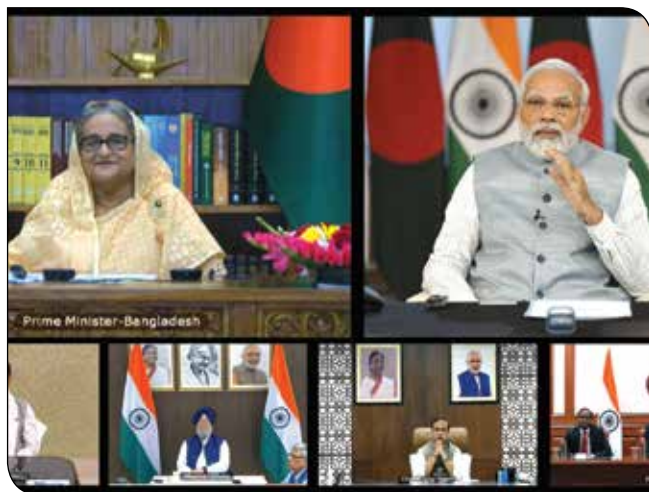
PM Shri Narendra Modi and the Bangladesh PM Sheikh Hasina jointly inaugurates the India-Bangladesh Friendship Pipeline on March 18, 2023