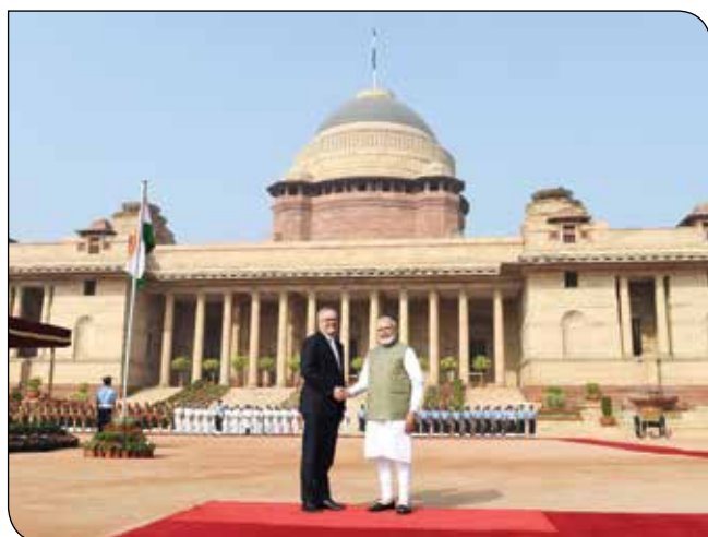
PM Shri Narendra Modi welcomes the Australian Prime Minister, Mr. Anthony Albanese at Rashtrapati Bhawan in New Delhi on March 10, 2023