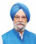
HARDEEP S PURI

As the world's fastest-growing major economy with rising energy needs, India will account for approximately 25 per cent of the global energy demand growth between 2020-2040, as per BP energy outlook and IEA estimates. Ensuring energy access, availability and affordability for our large population is imperative. This makes our case sui generis and has driven our energy strategy, now acknowledged the world over as being pragmatic and balanced.