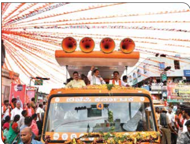
BJP National President Shri JP Nadda and other senior leaders at a Road Show in Challakere, Karnataka on March 17, 2023