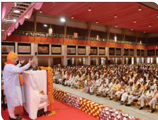
BJP National President Shri JP Nadda addressing "Shakti Kendra Samagam" at Samalkha Patti Kalyana, Haryana on March 19, 2023