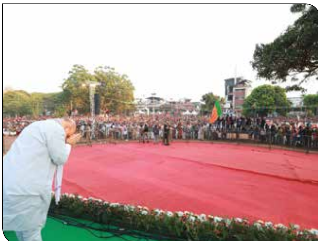
Union Home and Cooperation Minister Shri Amit Shah receiving greetings during Janashakthi Rally in Thrissur, Kerala on March 12, 2023