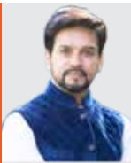
ANURAG SINGH THAKUR

A cross the globe, youngsters are making huge strides in science, sports, technology, business, politics, creativity, environmental sustainability and innovation, leveraging disruptive technology even in the face of macroeconomic shocks and geopolitical uncertainties. They are the ones with local solutions to global socio-economic problems.