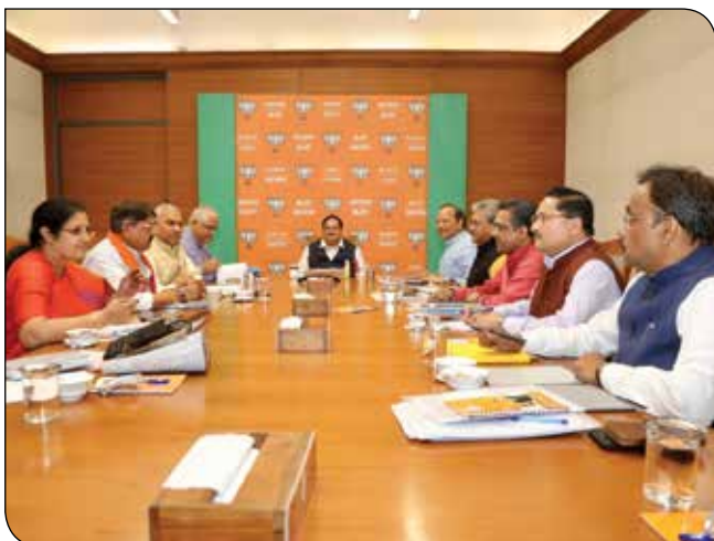
BJP National President Shri JP Nadda presiding over the BJP National General Secretaries Meeting at BJP HQ in New Delhi on March 15, 2023