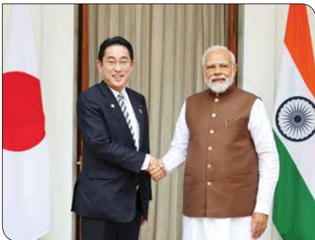
PM of Japan, Mr. Fumio Kishida calls on PM Shri Narendra Modi at Hyderabad House, in New Delhi on March 20, 2023