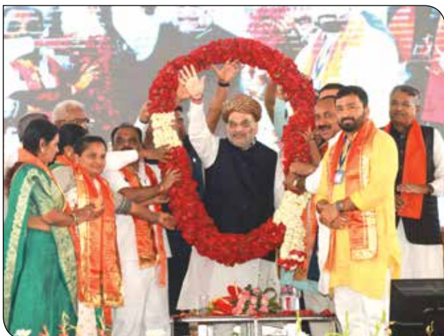
Union Home and Cooperation Minister Shri Amit Shah at the foundation stone laying ceremony of Junagadh District Co-operative Bank headquarters on March 19, 2023