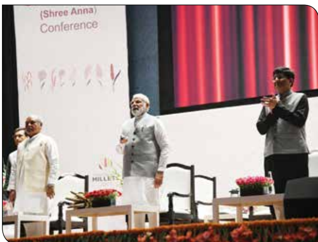
PM Shri Narendra Modi inaugurates Global Millets (Shree Anna) Conference at Subramaniam Hall (PUSA) in New Delhi on March 18, 2023