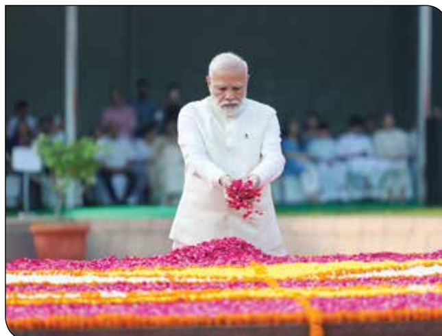
PM Shri Narendra Modi paying floral tributes at the Samadhi of former Prime Minister Shri Lal Bahadur Shastri on his Jayanti at Vijay Ghat in Delhi on October 02, 2023