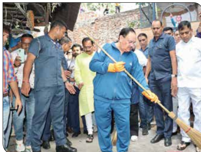
BJP President Shri JP Nadda participated in 'Swachhata Hi Seva' campaign in New Delhi on 01 October, 2023