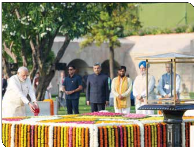
PM Shri Narendra Modi paying floral tributes at the Samadhi of Mahatma Gandhi on the occasion of Gandhi Jayanti at Rajghat in New Delhi on October 02, 2023