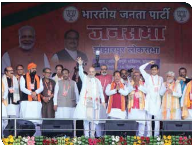
Union Home & Cooperation Minister Shri Amit Shah taking the greetings of people in a public meeting at Jhanjharpur, Bihar on 16 September, 2023