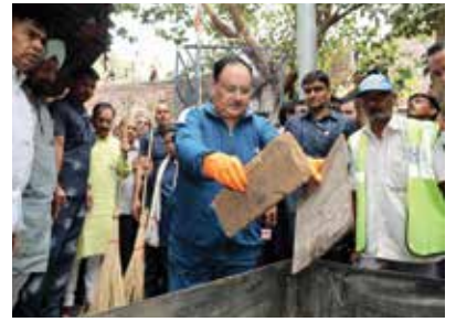
BJP KARYAKARTAS ARE MAKING THE CLEANLINESS CAMPAIGN A MASS MOVEMENT