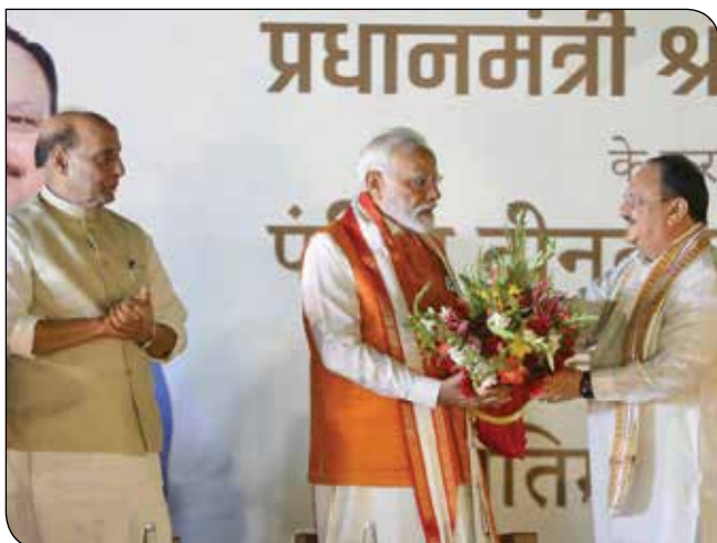
BJP National President Shri JP Nadda and Defence Minister Shri Rajnath Singh welcome PM Shri Narendra Modi before unveiling the statue of Pandit Deendayal Upadhyay in New Delhi on 25 September, 2023