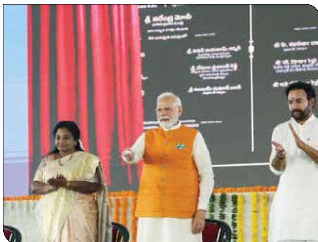
PM Shri Narendra Modi lays foundation stone and dedicates to nation various developmental projects at Mahbubnagar in Telangana on October 01, 2023