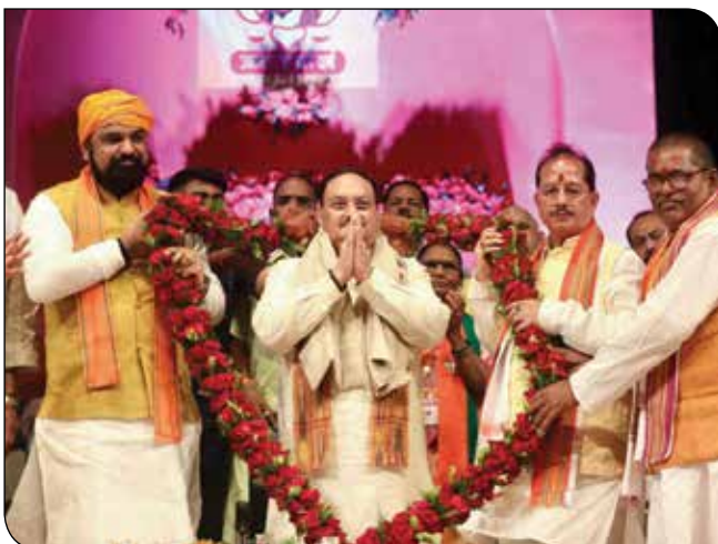
Bihar BJP welcomes BJP National President Shri JP Nadda at Kailashpati Mishraji's Janm Shatabdi Samaroh in Patna on 05 October, 2023