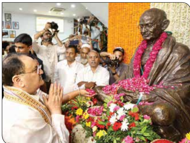
BJP National President Shri JP Nadda paying floral tributes at Khadi Store and purchased Khadi clothes on the occasion of Gandhi Jayanti at Connaught Place, New Delhi on 02 October, 2023