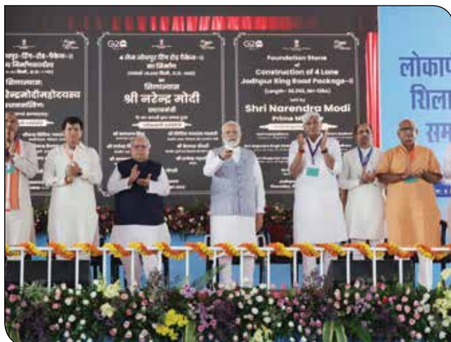
PM Shri Narendra Modi lays foundation stone and dedicates to nation various development projects at Jodhpur in Rajasthan on October 05, 2023