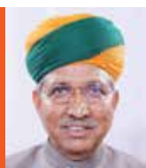
ARJUN RAM MEGHWAL

The first legislative agenda of the new Parliament building has set the tone for women-led development as a way forward for the nation. The Modi government has shown zeal to turn this sankalp into siddhi