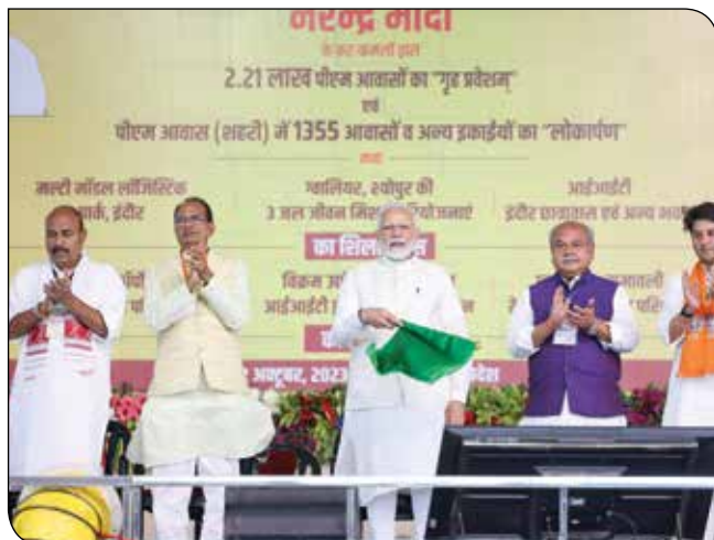
PM Shri Narendra Modi dedicates various projects and flags off train between Gwalior and Sumaoli in Madhya Pradesh on October 02, 2023