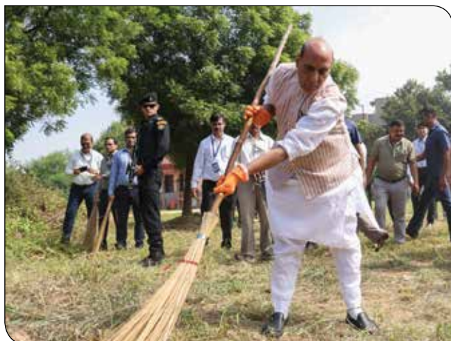
Defence Minister Shri Rajnath Singh participating in the 'Swachhata Hi Seva' campaign in New Delhi on 01 October, 2023