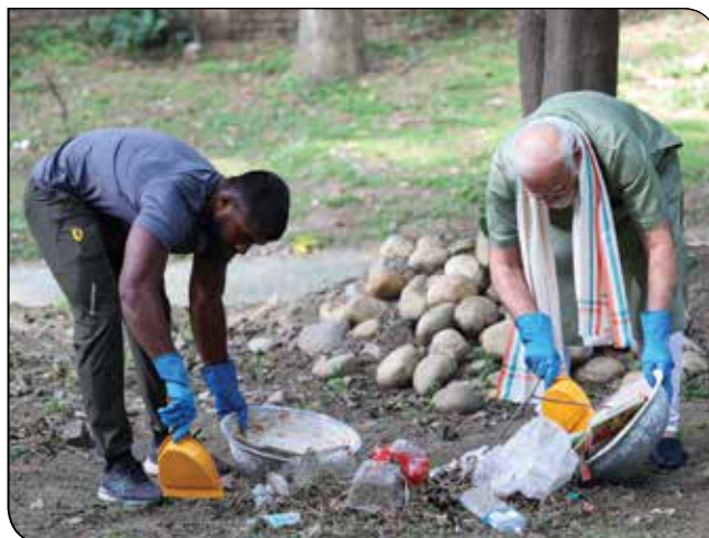
PM Shri Narendra Modi participating in 'Swachhta hi Seva' campaign in the remembrance of Father of the Nation Mahatma Gandhi in New Delhi on October 01, 2023