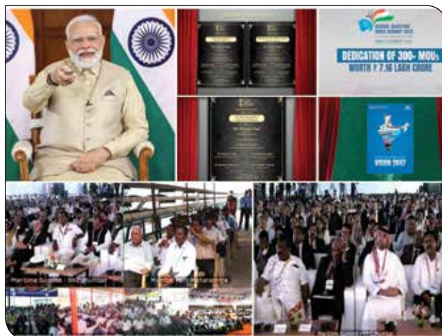
PM Shri Narendra Modi inaugurating the 3rd edition of Global Maritime India Summit (GMIS) 2023 on October 17, 2023