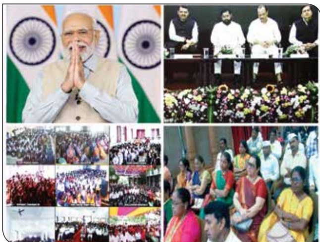
PM Shri Narendra Modi addressing at the launch of 'Pramod Mahajan Grameen Kaushalya Vikas Kendras' in Maharashtra on October 19, 2023