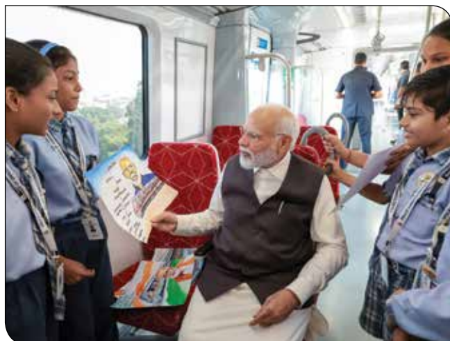
PM Shri Narendra Modi flagging off the RapidX train 'Namo Bharat' between Sahibabad to Duhai Depot in Uttar Pradesh on October 20, 2023. After launching, the PM also interacting with school children and crew of RapidX train onboard.