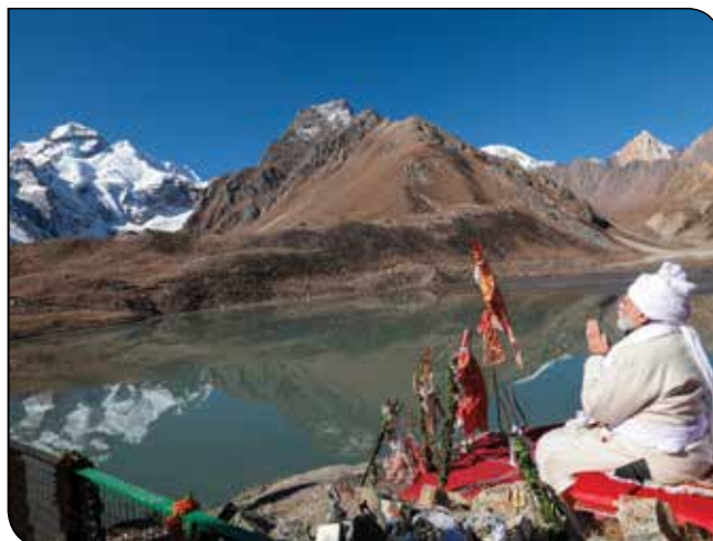
PM Shri Narendra Modi performs pooja and darshan at Parvati Kund at Pithoragarh in Uttarakhand on October 12, 2023