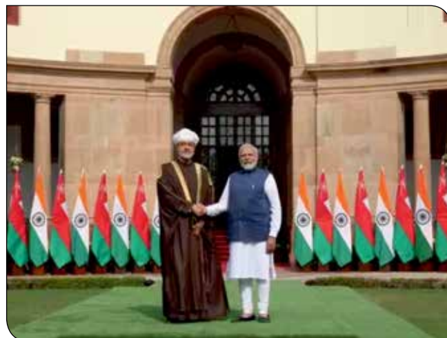
Prime Minister Shri Narendra Modi meet Sultan of Oman Majesty Sultan Haitham bin Tariq in New Delhi on December 16, 2023