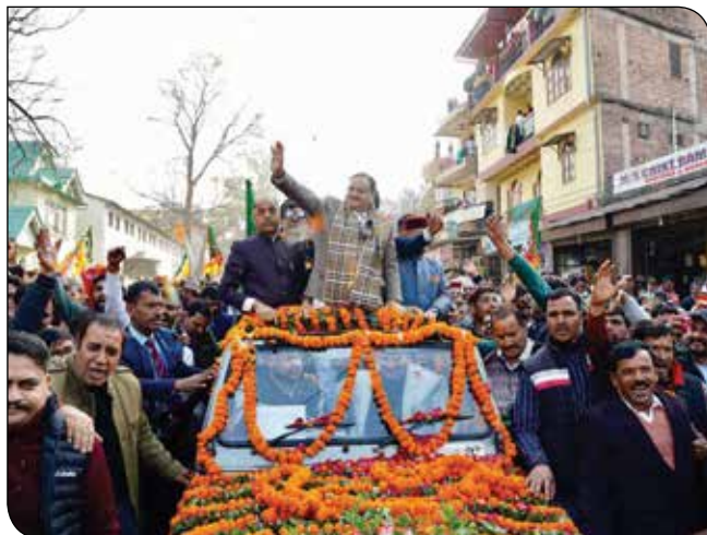
BJP National President Shri JP Nadda at a grand Road show in Sundar Nagar, Himachal Pradesh on 16 December, 2023