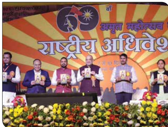
Union Home & Cooperation Minister Shri Amit Shah inaugurating 69th National Adhiveshan of ABVP in New Delhi on 08 December, 2023