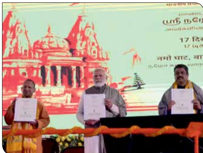
PM Shri Narendra Modi inaugurates Kashi Tamil Sangamam 2023 in Varanasi, Uttar Pradesh on December 17, 2023