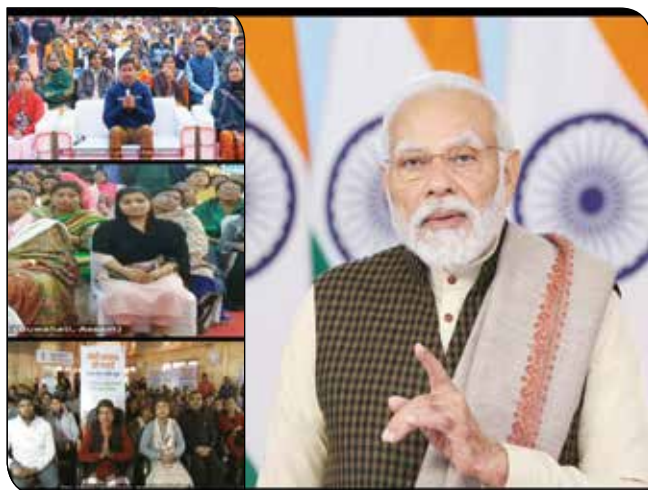
PM Shri Narendra Modi addresses beneficiaries of the Viksit Bharat Sankalp Yatra via video conferencing on December 16, 2023