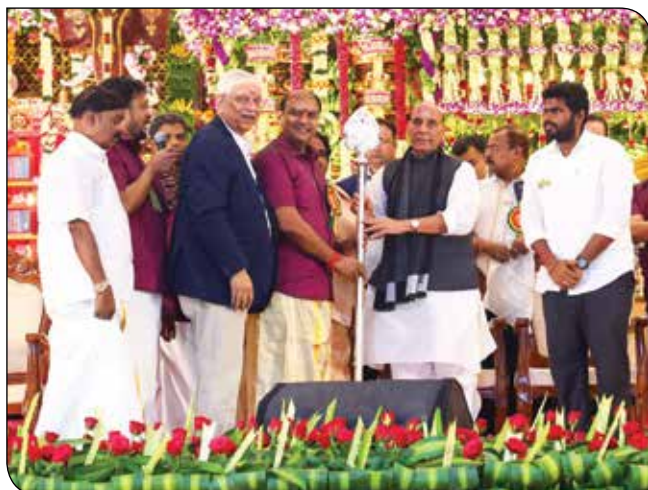
Defence Minister Shri Rajnath Singh at the Thirumurai Festival in Chennai, Tamil Nadu on 16 December, 2023