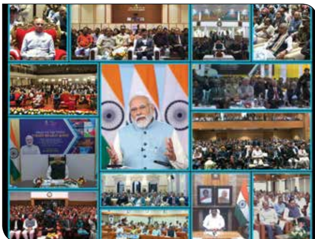
PM Shri Narendra Modi addressing at the launch of Viksit Bharat @ 2047: Voice of Youth on December 11, 2023