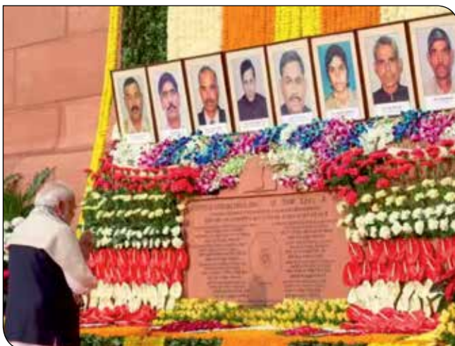
PM Shri Narendra Modi pays heartfelt tributes to brave security personnel martyred in the Parliament attack in 2001 on December 13, 2023