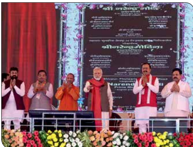
PM Shri Narendra Modi lays foundation stone and dedicates to nation multiple development projects worth over 19,150 crores in Varanasi, Uttar Pradesh on December 18, 2023