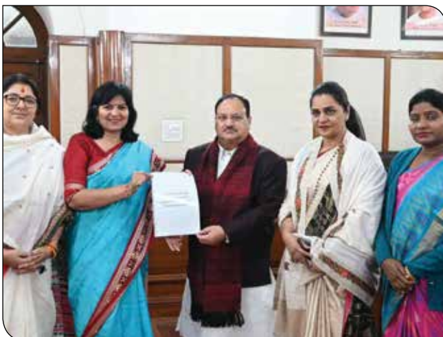
BJP National President Shri JP Nadda receiving the report by BJP Fact Finding Team, constituted to inquire about the heinous atrocity committed against a tribal woman in Belagavi, Karnataka on 18 December, 2023