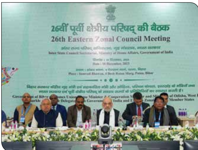
Union Home & Cooperation Minister Shri Amit Shah presiding the 26th meeting of the Eastern Regional Council in Patna, Bihar on 10 December, 2023