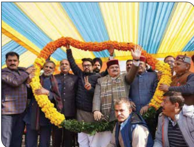
Himachal Pradesh BJP welcomes BJP National President Shri JP Nadda at the Abhinandan Samaroh in Bilaspur on 16 December, 2023