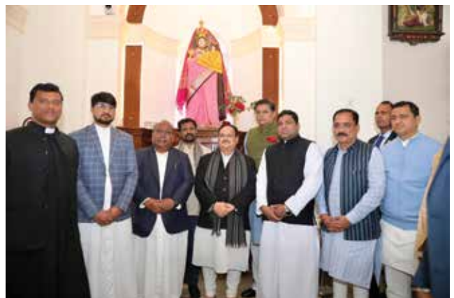
BJP National President Shri JP Nadda visited the Sacred Heart Cathedral Catholic Church in Delhi on the occasion of Christmas

The Prime Minister said, "The nation proudly acknowledges the contribution of the Christian Community". Prime Minister Shri Modi praised the contributions of the Christian Community to the freedom movement and highlighted the various intellectual thinkers and leaders. Prominent persons from the Christian community from across the country participated in the interaction. ■