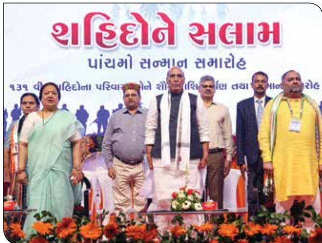
Defence Minister Shri Rajnath Singh attending an event organised to support the families of India's braveheart Jawans in Surat, Gujarat on 30 December, 2023