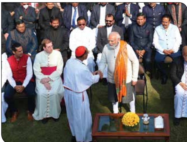
PM Shri Narendra Modi attends a programme with Christian community on the occasion of Christmas, in New Delhi on December 25, 2023