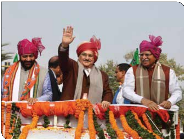
BJP National President Shri JP Nadda along with Haryana CM Shri Manohar Lal Khattar & others at a grand Road show in Panchkula, Haryana on 06 January, 2024