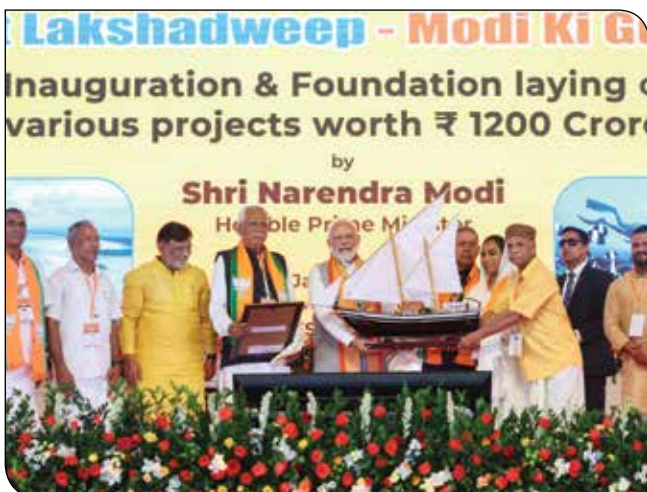
PM Shri Narendra Modi laying foundation stone of various projects at Kavaratti, in Lakshadweep on January 03, 2024