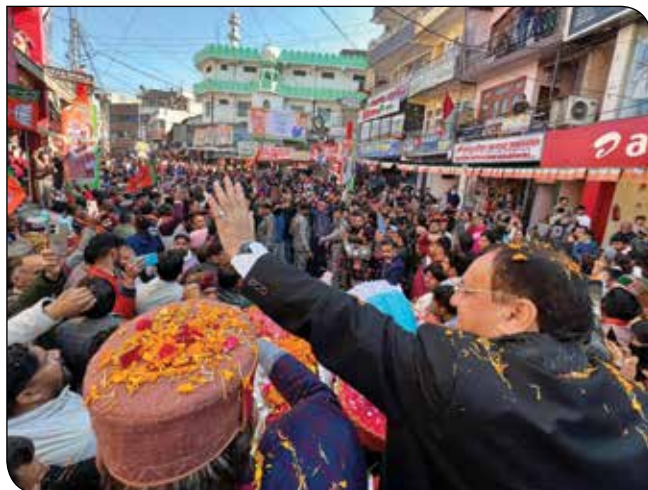
Himachal BJP welcoming BJP National President Shri JP Nadda with a massive Road show in Solan on 05 January, 2024