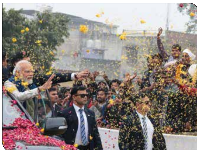
PM Shri Narendra Modi receives warm welcome by people during his arrival at Ayodhya in Uttar Pradesh on December 30, 2023