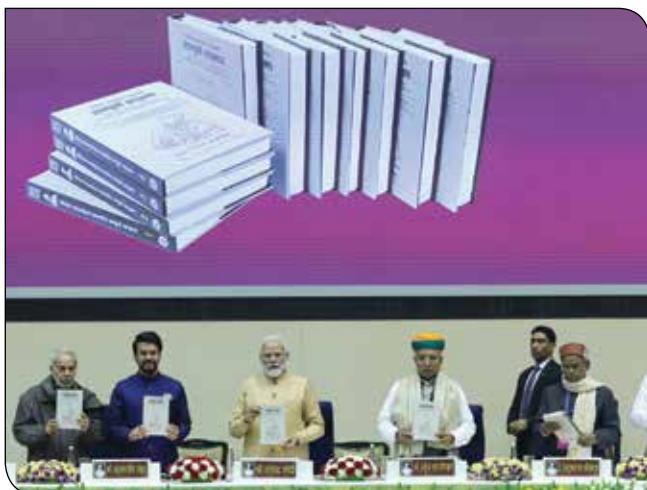
PM Shri Narendra Modi releases the Collected Works of Pandit Madan Mohan Malaviya on his 162nd Birth Anniversary at Vigyan bhawan in New Delhi on December 25, 2023