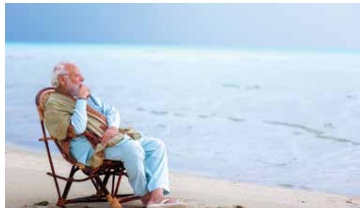
PM Shri Narendra Modi visits pris

PM Modi mentioned steps taken for the Haj Yatris that have benefited the people of Lakshadweep too.