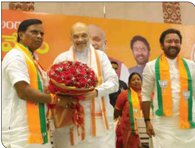
Union Home and Cooperation Minister Shri Amit Shah at the Telangana State BJP Mandal Presidents meeting in Ranga Reddy, Hyderabad on 28 December, 2023