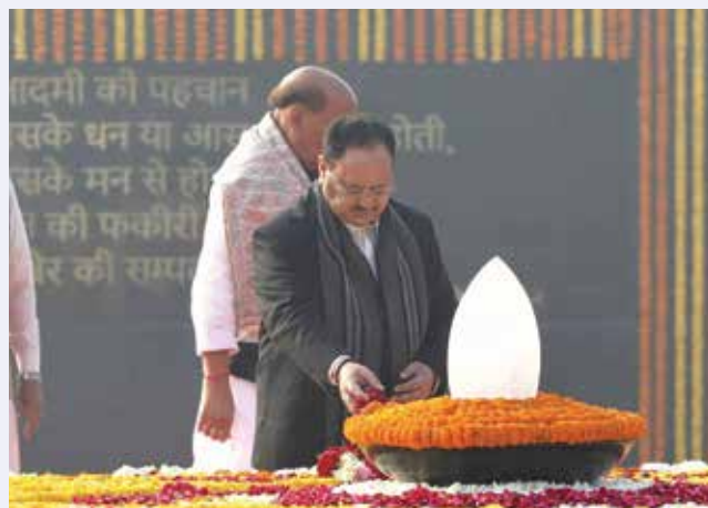
PM Shri Narendra Modi and BJP National President Shri JP Nadda paying floral tributes on the Birth Anniversary of Former Prime Minister Bharat Ratna Shri Atal Bihari Vajpayee ji at 'Sadaiv Atal' in New Delhi on 25 December, 2023