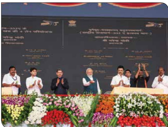
PM Shri Narendra Modi lays foundation stone and dedicates to nation various projects at Tiruchirappalli in Tamil Nadu on January 02, 2024