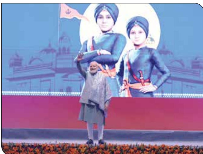
PM Shri Narendra Modi graced the programme marking 'Veer Baal Diwas' at Bharat Mandapam in New Delhi on December 26, 2023