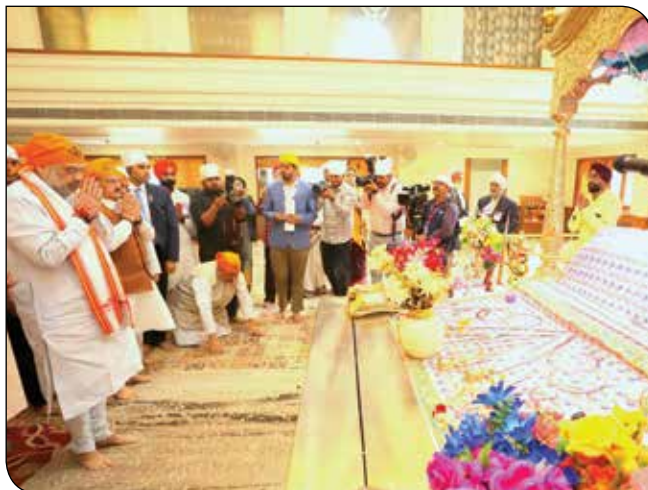
On the occasion of Veer Bal Diwas, BJP National President Shri JP Nadda & Union Home Minister Shri Amit Shah praying at Gurudwara Bara Sikh Sangat, in Kolkata, West Bengal on 26 December, 2023