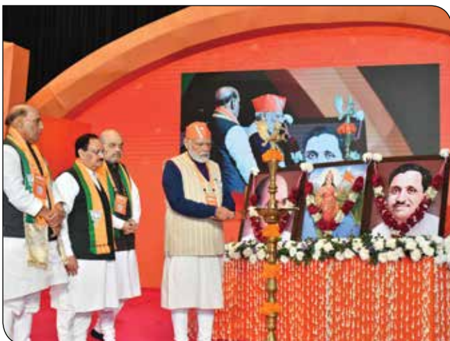
PM Shri Narendra Modi along with BJP National President Shri JP Nadda, Union Ministers Shri Rajnath Singh and Shri Amit Shah lighting the lamp at the inauguration of BJP National Convention in New Delhi on 17 February, 2024