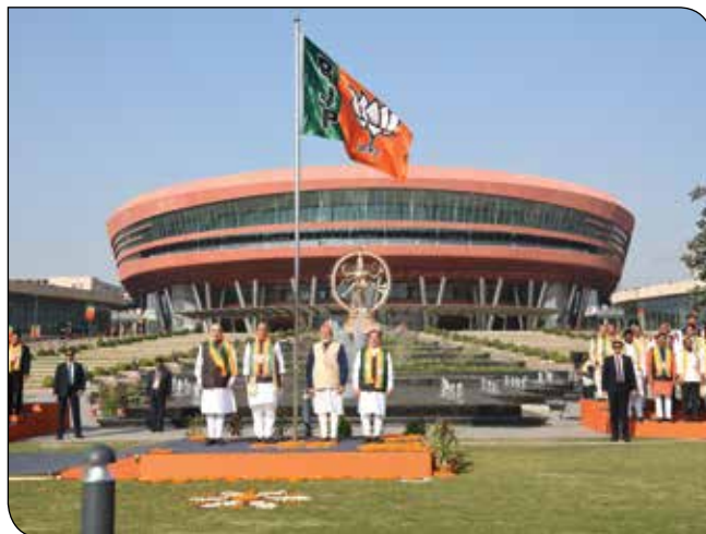
PM Shri Narendra Modi along with BJP National President Shri JP Nadda, Union Ministers Shri Rajnath Singh and Shri Amit Shah unfurling the Party flag at the BJP National Convention, New Delhi on 17 February, 2024