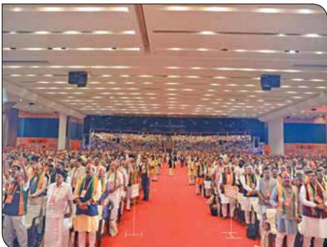
Grand view of the BJP National Convention at Bharat Mandapam, New Delhi on 17 February, 2024