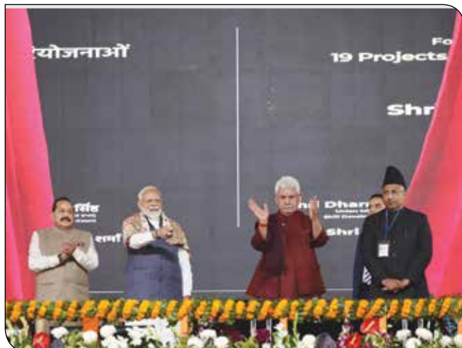
PM Shri Narendra Modi dedicates to the nation and lays the foundation stone of multiple development projects in Jammu, J&K on February 20, 2024