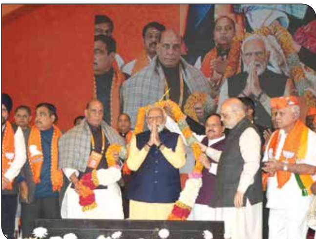
BJP National President Shri JP Nadda, Union Ministers Shri Rajnath Singh, Shri Amit Shah and other leaders welcoming PM Shri Narendra Modi at the BJP National Convention in New Delhi on 17 February, 2024