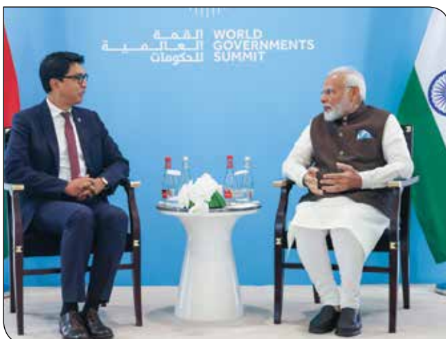
PM Shri Narendra Modi in a bilateral meeting with the President of Madagascar, Mr. Andry Rajoelina in Abu Dhabi on February 14, 2024