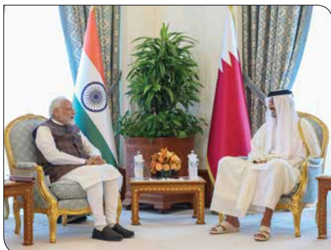
PM Shri Narendra Modi holds a bilateral meeting with the Emir of Qatar, Sheikh Tamim bin Hamad Al Thani at Doha in Qatar on February 15, 2024