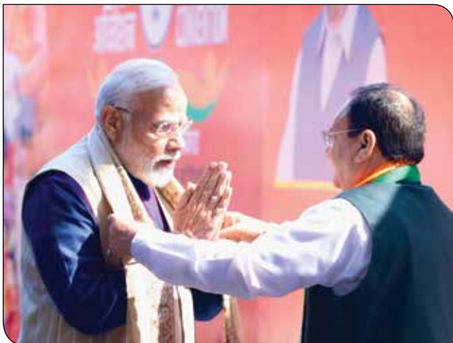
BJP National President Shri JP Nadda welcoming PM Shri Narendra Modi to the BJP National Convention held at Bharat Mandapam, New Delhi on 17 February, 2024