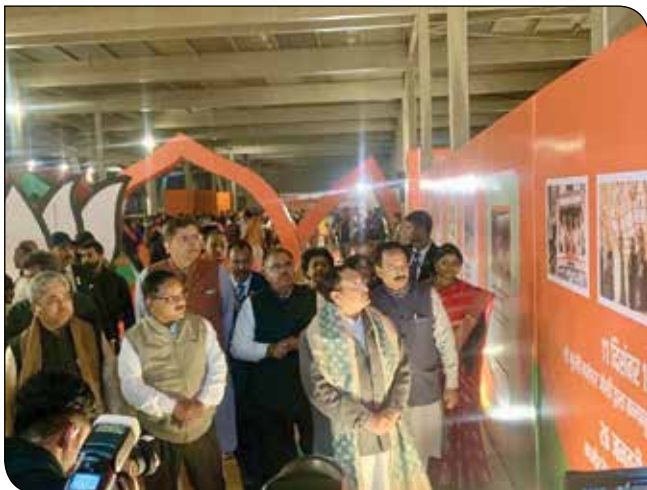
BJP National President Shri JP Nadda along with other senior leaders visiting the exhibition at the BJP National Convention in New Delhi on 17 February, 2024