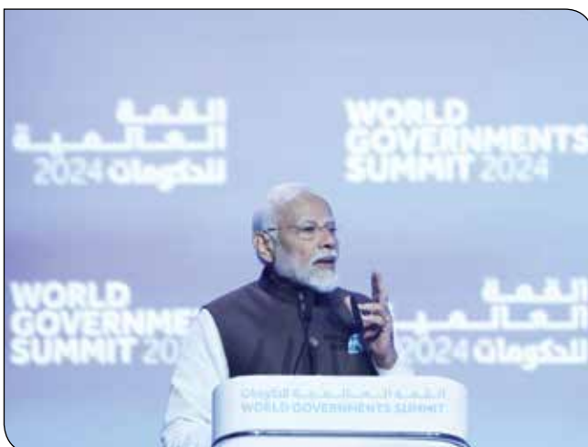
PM Shri Narendra Modi addressing the gathering of world leaders at the World Government Summit in Dubai on February 14, 2024