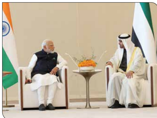
PM Shri Narendra Modi attends the India-UAE delegation level talks with the President of the United Arab Emirates, Sheikh Mohammed bin Zayed Al Nahyan at Abu Dhabi in UAE on February 13, 2024