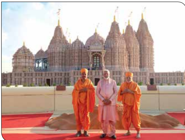
PM Shri Narendra Modi at the inauguration of the BAPS temple in Abu Dhabi, UAE on February 14, 2024