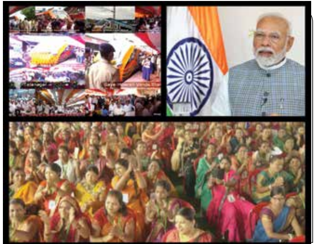
PM Shri Narendra Modi laying the foundation stone and dedicating to the nation various Railway Projects at Tatanagar (Jamshepur) in Jharkhand on September 15, 2024.