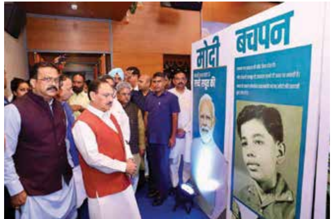
BJP National President & Union Minister Shri JP Nadda inaugurating the exhibition on the occasion of Hon'ble Prime Minister Shri Narendra Modi's Birthday at BJP HQ, New Delhi on 17 September 2024

Shri Nadda said that under the Prime Minister Ayushman Jan Arogya Yojana, people above the age of 70, regardless of their income or social background, will now receive free medical treatment up to Rs. 5 lakh annually. The fourth phase of the Pradhan Mantri Gramin Sadak Yojana has been approved, which aims to connect 25,000 villages by constructing 62,500 kilometers of all-weather rural roads. Numerous significant initiatives have been launched in the third