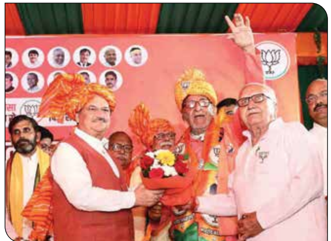
Haryana BJP welcomes BJP National President & Union Minister Shri JP Nadda at the "Karyakarta Sammelan" in Rohtak on 19 September 2024