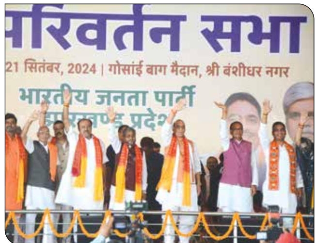
Union Minister Shri Rajnath Singh receiving the greetings at 'Pariwartan Sabha' at Shri Banshidhar Nagar, Garhwa in Jharkhand on 21 September 2024