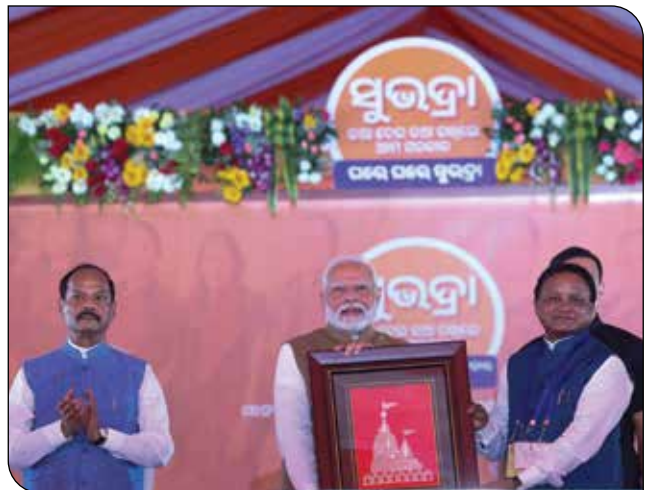
PM Shri Narendra Modi launching 'SUBHADRA' - the largest women-centric scheme and various development projects in Bhubaneswar, Odisha on September 17, 2024.