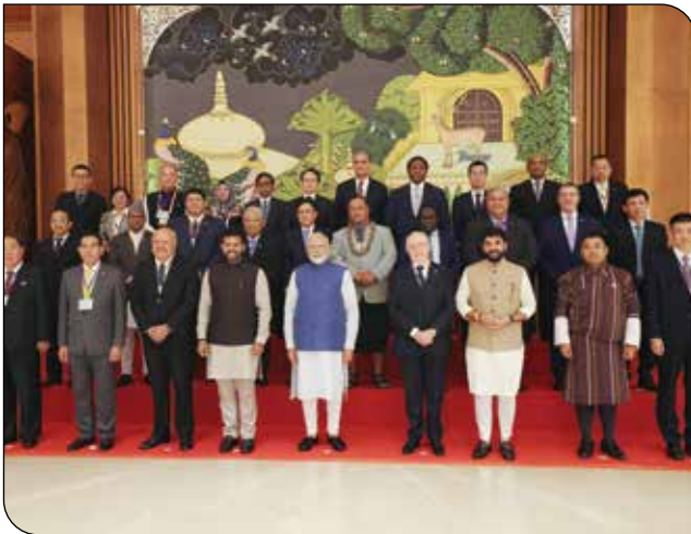
PM Shri Narendra Modi at an exhibition showcased on the 2nd Asia-Pacific Ministerial Conference on Civil Aviation at Bharat Mandapam in New Delhi on September 12, 2024.