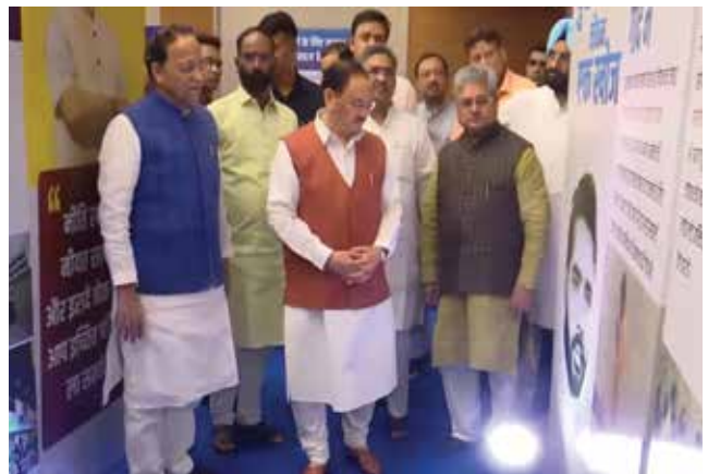
BJP National President & Union Minister Shri JP Nadda visiting the exhibition on the occasion of Hon'ble Prime Minister Shri Narendra Modi's Birthday at BJP HQ, New Delhi on 17 September 2024