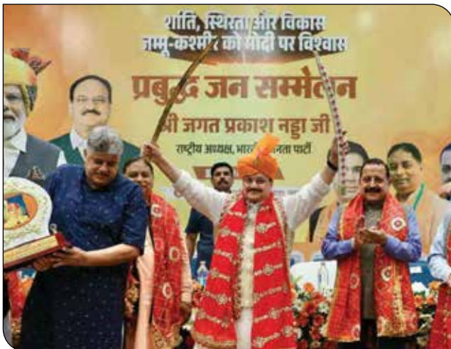
Jammu and Kashmir BJP welcomes BJP National President & Union Minister Shri JP Nadda at the Intellectual meet in Jammu on 22 September 2024