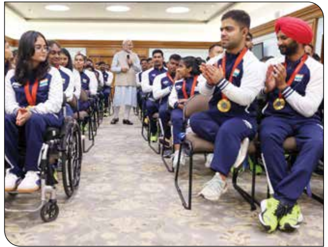
PM Shri Narendra Modi interacting with the Indian Contingent of the Paris Paralympic 2024 in New Delhi on September 12, 2024.