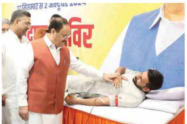
BJP National President & Union Minister Shri JP Nadda visiting the blood donation camp on the occasion of Hon'ble Prime Minister Shri Narendra Modi's Birthday at BJP HQ, New Delhi on 17 September 2024