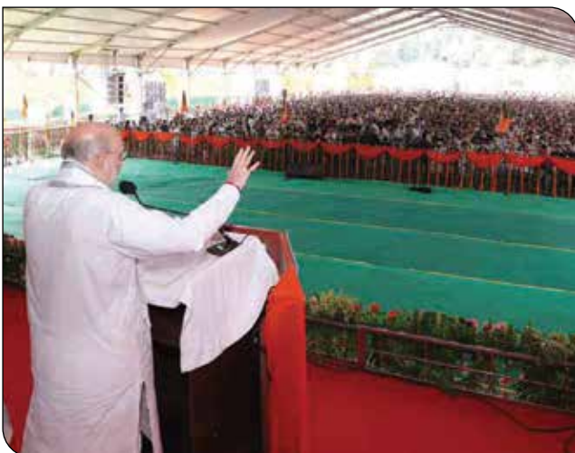
Union Home & Cooperation Minister Shri Amit Shah addressing a huge public rally in Mendhar, Jammu & Kashmir on 21 September 2024