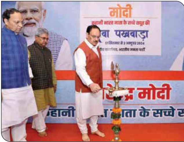
BJP National President & Union Minister Shri JP Nadda and senior leaders of the party inaugurating the "Seva Pakhwada" and exhibition on the occasion of Hon'ble Prime Minister Shri Narendra Modi's Birthday at BJP HQ, New Delhi on 17 September 2024