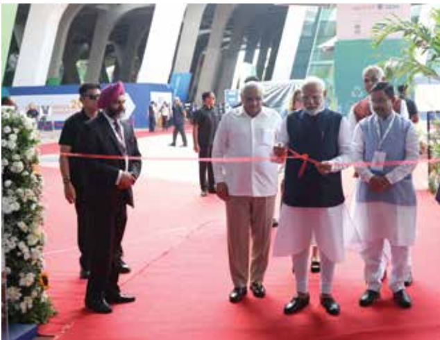
PM Shri Narendra Modi inaugurates the 4th Global Renewable Energy Investors Meet and Expo (RE-INVEST) at Gandhinagar in Gujarat on September 16, 2024.