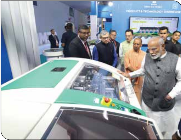
PM Shri Narendra Modi visits an exhibition during the inauguration of SEMICON India 2024 at India Expo Mart, Greater Noida in Uttar Pradesh on September 11, 2024.