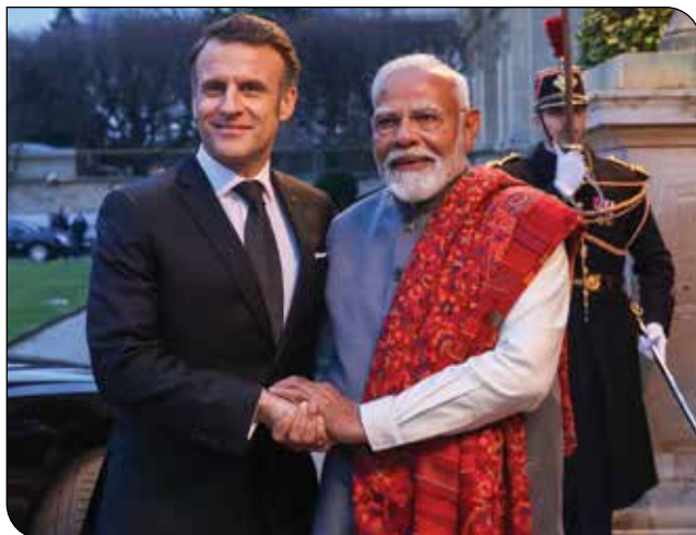
President Macron welcomes PM Shri Narendra Modi to India-France CEO Forum on February 11, 2025