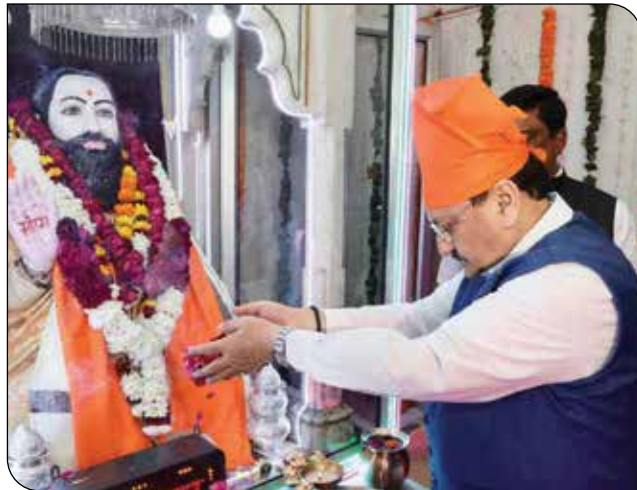
BJP National President and Union Minister Shri JP Nadda offering prayers at Shri Guru Ravidas Vishram Dham Mandir Trust on the occasion of "Guru Ravidas Jayanti" at Deshbandhu Gupta Road, New Delhi on 12 February, 2025