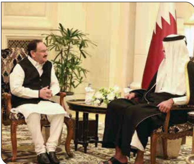
BJP National President and Union Minister Shri Jagat Prakash Nadda meets His Highness Sheikh Tamim Bin Hamad Al Thani, Amir of the State of Qatar in New Delhi on 18 February, 2025