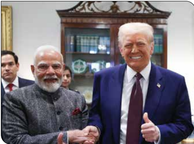
PM Shri Narendra Modi meets the President of USA, Mr. Donald Trump at White House in Washington DC, USA on February 13, 2025