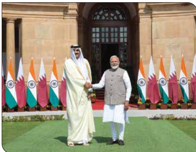
PM Shri Narendra Modi meets the Amir of the State of Qatar, Sheikh Tamim Bin Hamad AL Thani at Hyderabad House in New Delhi on February 18, 2025