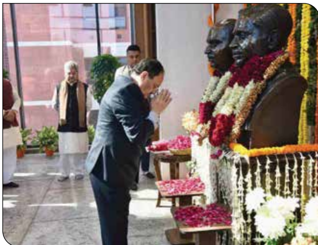
BJP National President and Union Minister Shri JP Nadda paying floral tributes to Pt. Deendayal Upadhyay ji on his Punyatithi at BJP HQ, New Delhi on 11 February, 2025