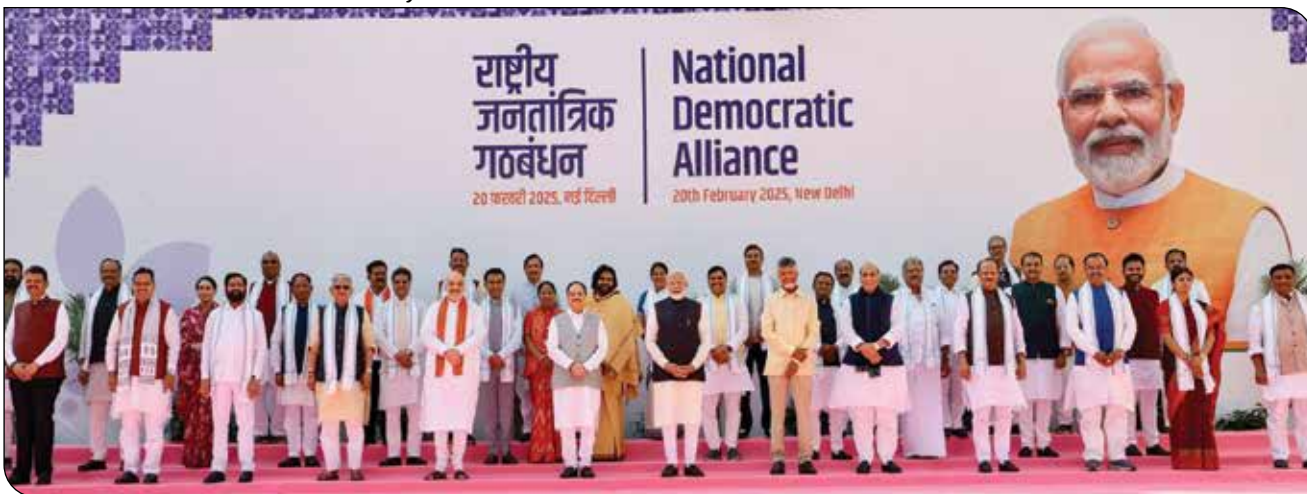
PM Shri Narendra Modi, BJP National President and Union Minister Shri JP Nadda, Defence Minister Shri Rajnath Singh, Union Home & Cooperation Minister Shri Amit Shah and other senior NDA leaders attending the NDA meeting held in New Delhi on 20 February, 2025