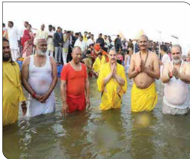
BJP National President Shri JP Nadda along with the CM of UP Yogi Adityanath taking Holy Dip in Sangam & offered prayers in Prayagraj, U.P on 22 February, 2025