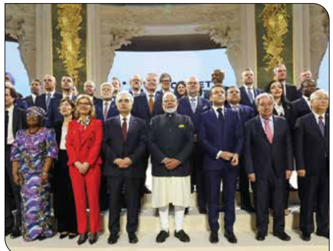
Group photograph of the global leaders participated at the AI Action Summit in Paris on February 11, 2025