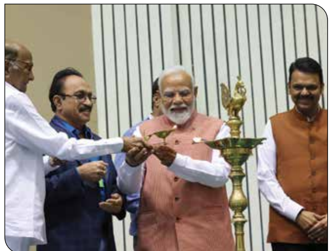
PM Shri Narendra Modi lighting the lamp at the inauguration of 98th Akhil Bharatiya Marathi Sahitya Sammelan in New Delhi on February 21, 2025