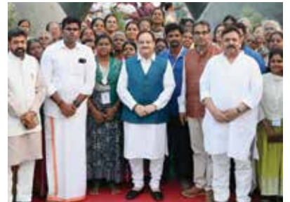
"Kashi Tamil Sangamam showcases India's unity amidst immense cultural diversity"