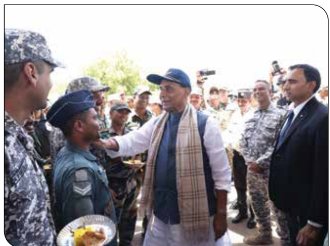
Defence Minister Shri Rajnath Singh visits the Bhuj Air Force Station in Gujarat and interacted with brave Air Warriors and soldiers on 16 May, 2025