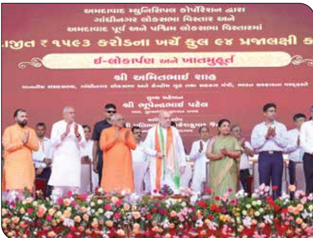
Union Home and Cooperation Minister Shri Amit Shah inaugurating and laying the foundation stone of various development projects in Naranpura, Gujarat on 18 May, 2025