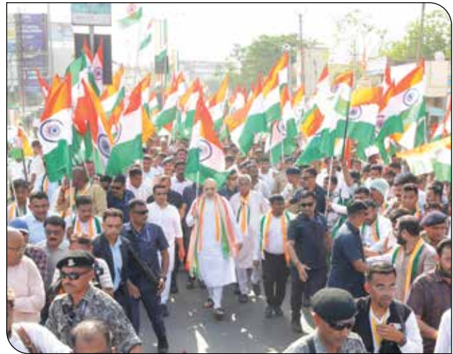
Union Home and Cooperation Minister Shri Amit Shah participating in the Tiranga Yatra in Gandhinagar, Gujarat on 18 May, 2025