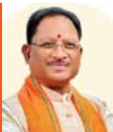
VISHNU DEO SAI

For nearly four decades, Bastar lived under the shadow of left-wing extremism. Today, it stands on the cusp of transformation. Fear is giving way to hope, driven by targeted welfare programmes for the people of the tribal heartland and sustained by strategic security operations.