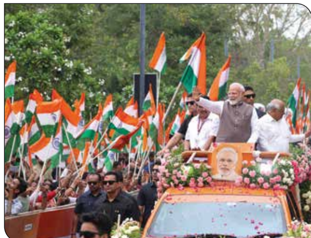
PM Shri Narendra Modi receives warm welcome by people at Gandhinagar in Gujarat on May 27, 2025