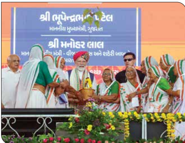
PM Shri Narendra Modi at the foundation laying, inauguration and dedication to the nation various projects at Bhuj, in Gujarat on May 26, 2025