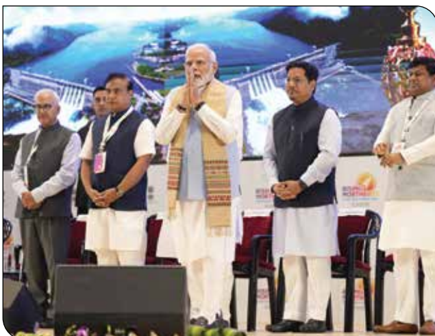
PM Shri Narendra Modi attends the Rising North East Investors Summit in Bharat Mandapam, New Delhi on May 23, 2025