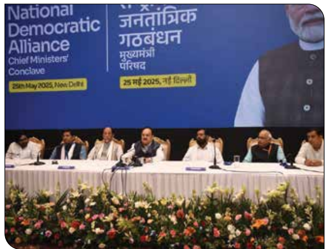
BJP National President & Union Minister Shri JP Nadda addressing a press conference at the conclusion of NDA Chief Ministers' Conclave held in New Delhi on 25 May, 2025