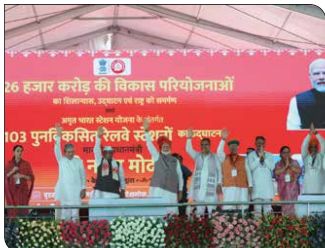
PM Shri Narendra Modi receives a warm welcome during the inauguration of various projects in Bikaner, Rajasthan on May 22, 2025