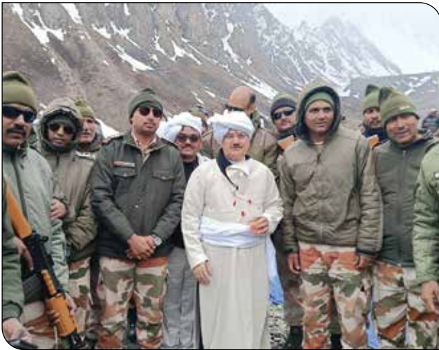
BJP National President & Union Minister Shri JP Nadda visits Adi-Kailash, a sacred place of spirituality and culture in Pithoragarh, Uttarakhand on 18 May, 2025