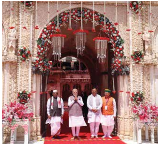
PM Shri Narendra Modi along with other senior leaders performing Darshan and Pooja at Karni Mata Temple in Bikaner, Rajasthan on May 22, 2025

Outlining the three key principles established through Operation Sindoor in India's fight against terrorism, the Prime Minister stated the first principle