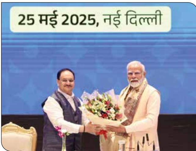
BJP National President & Union Minister Shri JP Nadda welcoming the Prime Minister, Shri Narendra Modi at NDA Chief Ministers' Conclave held in New Delhi on 25 May 2025