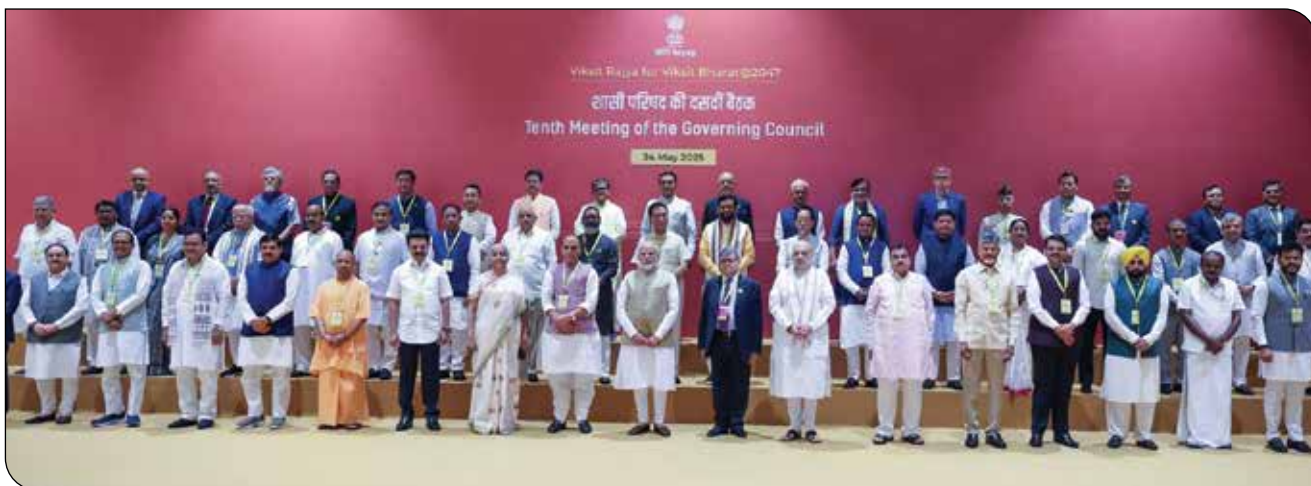
PM Shri Narendra Modi in a group photograph during the 10th Governing Council Meeting of NITI Aayog, in New Delhi on May 24, 2025