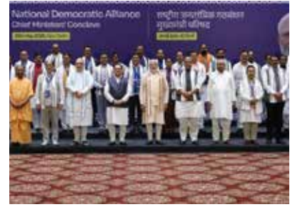
'Operation Sindoor: A symbol of the indomitable courage of our soldiers'