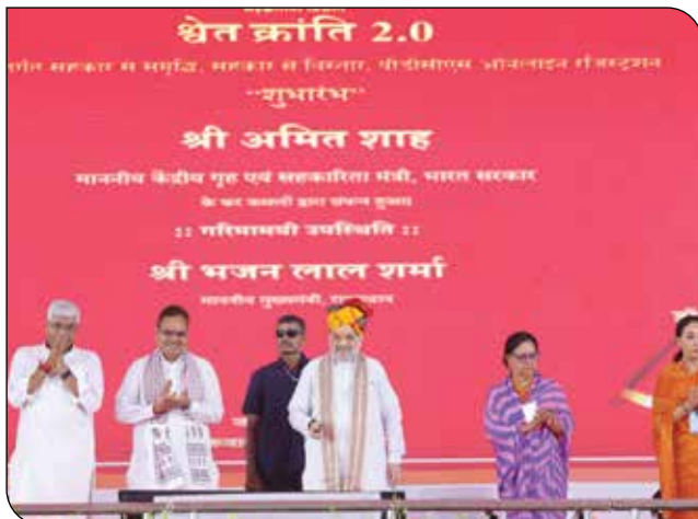
Union Home and Cooperation Minister Shri Amit Shah participating at the 'Cooperation and Employment Festival,' in Jaipur, Rajasthan on 17 July 2025