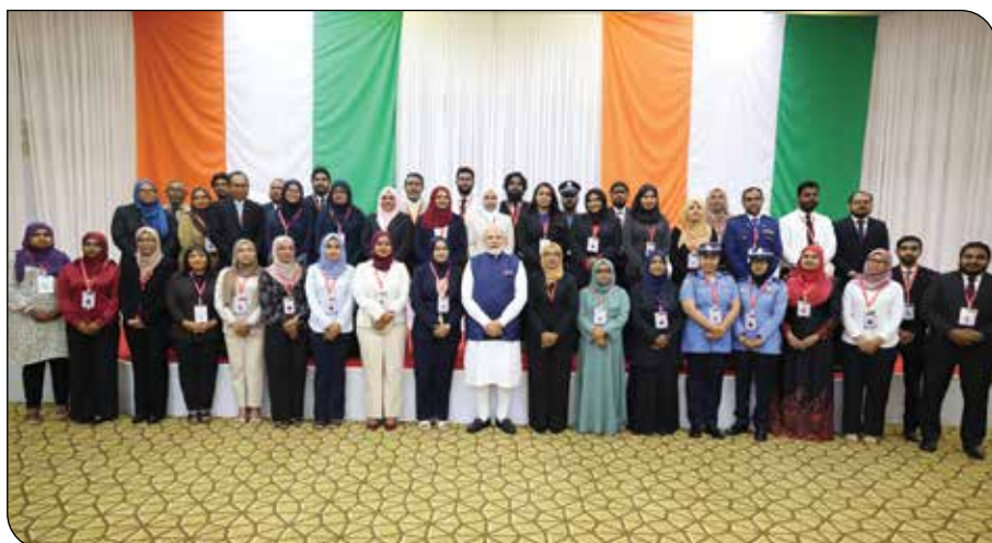
PM Shri Narendra Modi interacts with beneficiaries of the Indian Technical and Economic Cooperation (ITEC) Programme, in Maldives on July 26, 2025.