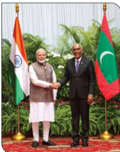
PM Shri Narendra Modi meets with the President of Maldives, Dr. Mohamed Muizzu at Malé in Maldives on July 25, 2025.