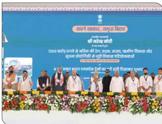
PM Shri Narendra Modi lays the foundation stone, inaugurates and dedicates to the Nation various projects at Motihari, in Bihar on July 18, 2025.