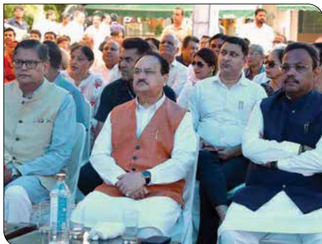
BJP National President and Union Minister Shri J.P. Nadda, BJP National Vice President Shri Baijayant Panda, BJP National Gen. Secretary Shri Vinod Tawde and others listening "Mann ki Baat" in New Delhi on 27 July 2025