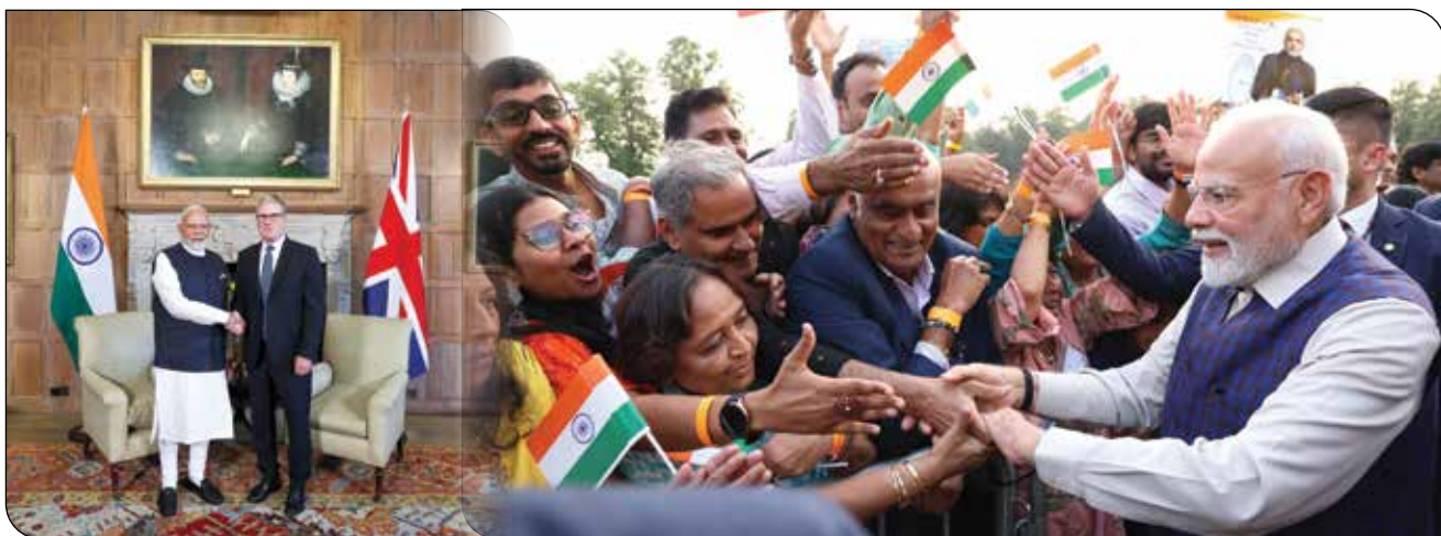
PM Shri Narendra Modi meets the Prime Minister of the United Kingdom, Mr. Keir Starmer and receiving a rousing welcome by Indian community at London in United Kingdom on July 23, 2025.