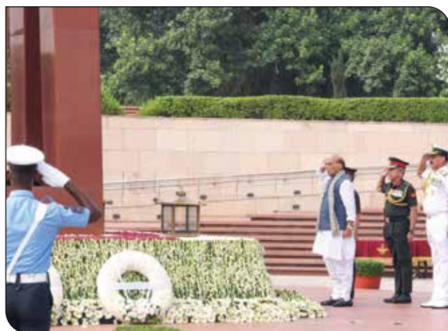
Defence Minister Shri Rajnath Singh paying tributes to India's bravehearts on Kargil Vijay Diwas at National War Memorial, in New Delhi on 26 July 2025