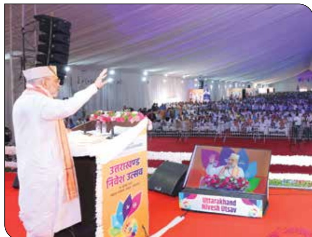
Union Home and Cooperation Minister Shri Amit Shah addressing at the 'Uttarakhand Investment Festival 2025' in Rudrapur, Uttarakhand, on 19 July 2025