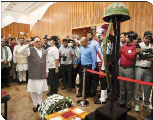
BJP National President and Union Minister Shri J.P. Nadda salutes the martyrs on the "Kargil Vijay Diwas Samaroh" in New Delhi on 26 July 2025