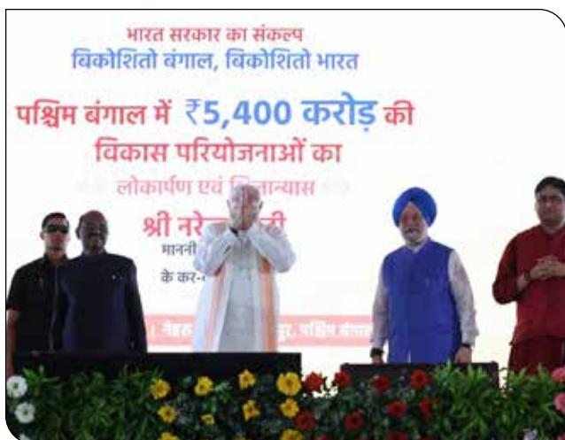
PM Shri Narendra Modi at the foundation stone laying and inauguration of various projects at Durgapur, in West Bengal on July 18, 2025.