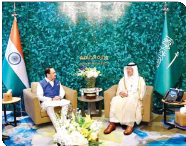
BJP National President and Union Minister Shri J.P. Nadda discussing with His Royal Highness Prince Abdulaziz bin Salman Al Saud, Kingdom of Saudi Arabia to enhance the economic partnership between the two countries in New Delhi on 13 July 2025