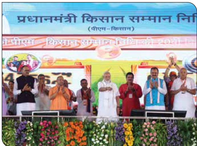
PM Shri Narendra Modi along with UP CM Yogi Adityanath and other senior leaders lays the foundation stone, inaugurates multiple development projects and releases the 20th instalment of PM-KISAN at Varanasi, Uttar Pradesh on August 02, 2025.