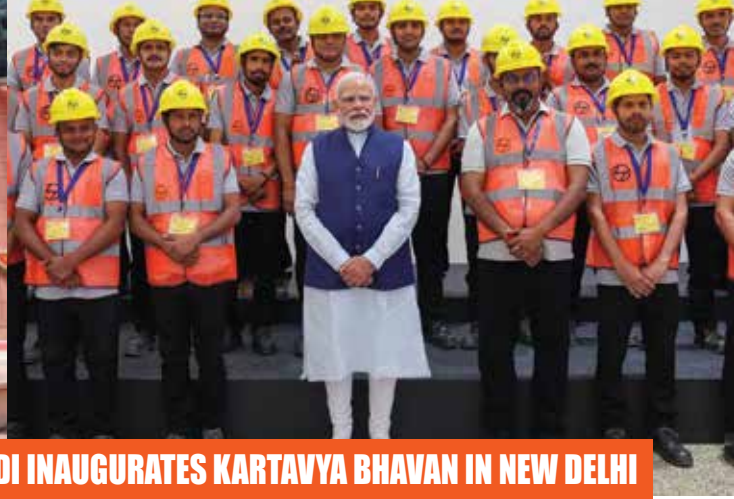
PM MODI INAUGURATES KARTAVYA BHAVAN IN NEW DELHI