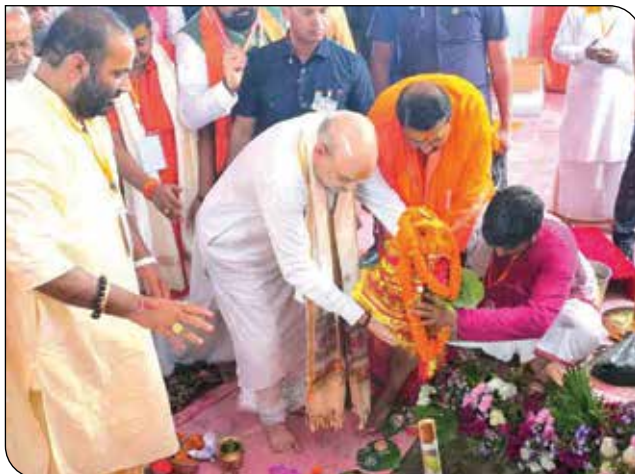
Union Home & Cooperation Minister Shri Amit Shah performing Bhoomi Pujan of Punaura Dham Temple in Sitamarhi, Bihar on 08 August 2025