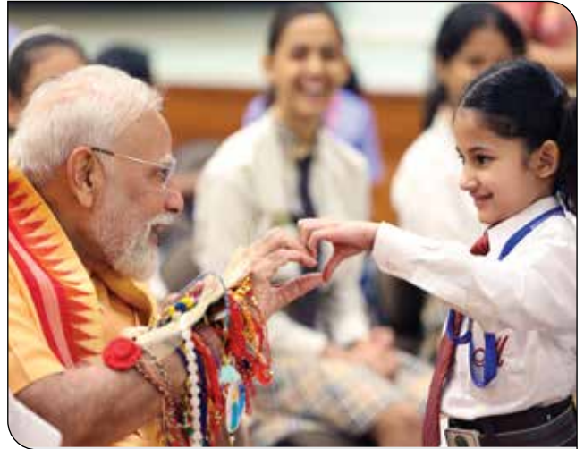
PM Shri Narendra Modi celebrating the festival of Raksha Bandhan with children at his residence (7, Lok Kalyan Marg), in New Delhi on 09 August 2025