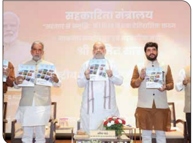
Union Home & Cooperation Minister Shri Amit Shah unveiling the 'National Cooperation Policy-2025' in New Delhi on July 24, 2025