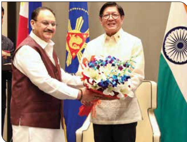
BJP National President and Union Minister Shri JP Nadda meeting with the President of the Philippines, H.E. Ferdinand R. Marcos Jr. in New Delhi on 05 August 2025