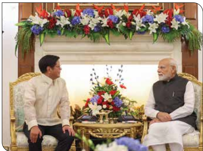
PM Shri Narendra Modi meets the President of the Republic of Philippines, Mr. Ferdinand Romualdez Marcos Jr. at Hyderabad House in New Delhi on August 05, 2025.