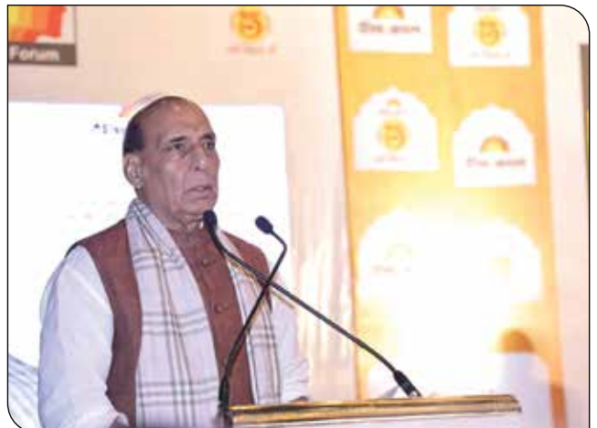
Defence Minister Shri Rajnath Singh addressing the 'Samarth Bihar and Sashakt Bharat' programme in Patna, Bihar on 02 August 2025