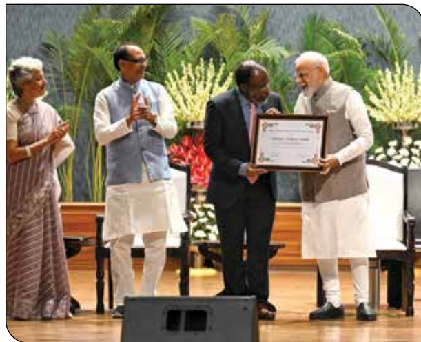
PM Shri Narendra Modi at the inauguration of M.S. Swaminathan Centenary International Conference at ICAR PUSA in New Delhi on August 07, 2025.