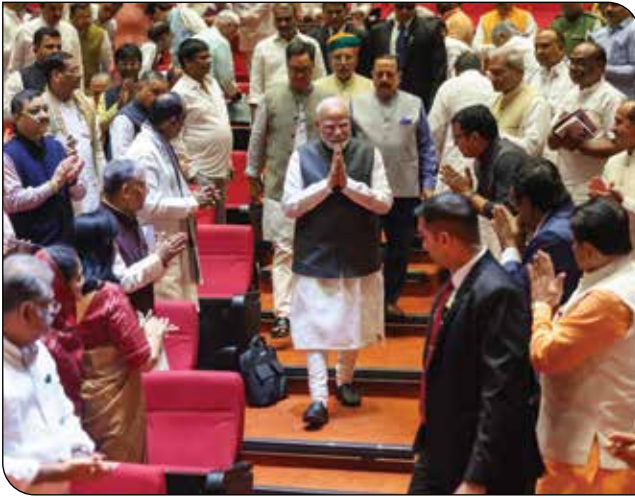
NDA MPs felicitating PM Shri Narendra Modi for the success of 'Operation Sindoor' and 'Operation Mahadev' at the NDA Parliamentary Meeting in Parliament House, New Delhi on 05 August 2025