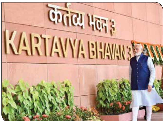
PM Shri Narendra Modi inaugurates the newly constructed Kartavya Bhavan at Kartavya Path and interacts with Shramjeevis in New Delhi on August 06, 2025.