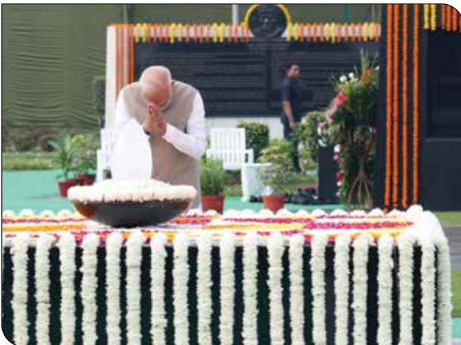
PM Shri Narendra Modi paying tributes to former Prime Minister of India Bharat Ratna Shri Atal Bihari Vajpayee on his Punyatithi at Sadaiv Atal in New Delhi on August 16, 2025