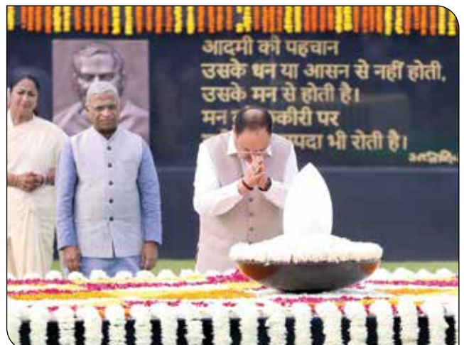
BJP National President and Union Minister Shri JP Nadda paying tribute to former Prime Minister 'Bharat Ratna' Atal Bihari Vajpayee ji on his Punyatithi by visiting 'Sadaiv Atal' on 16 August 2025