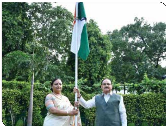
BJP National President and Union Minister Shri JP Nadda participates on the nationwide campaign of Har Ghar Tiranga by hoisting a flag at his residence in New Delhi on 13 August 2025