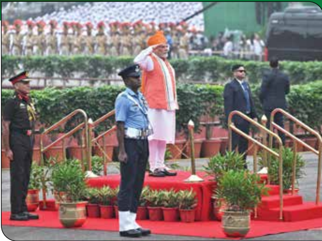
PM Shri Narendra Modi inspecting the Guard of Honour on the occasion of 79th Independence Day celebrations at Red Fort in Delhi on August 15, 2025