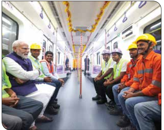
After inaugurating the new phase of Metro Rail, PM Shri Narendra Modi undertakes a metro ride at Kolkata in West Bengal on August 22, 2025