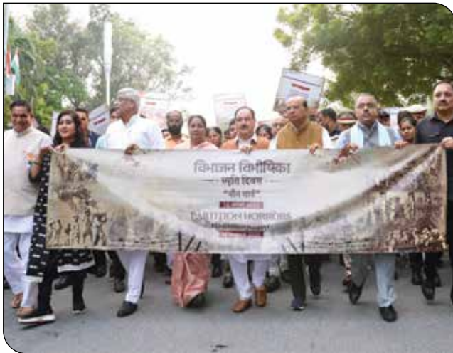
BJP National President and Union Minister Shri JP Nadda participates in a silent procession in remembrance of Vibhajan Vibhishika Smriti Diwas & inaugurates an exhibition at Connaught Place, New Delhi on 14 August 2025