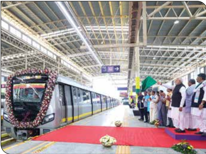
PM Shri Narendra Modi flags-off Yellow line under the Bangalore Metro Phase-2 project at Bengaluru in Karnataka on August 10, 2025