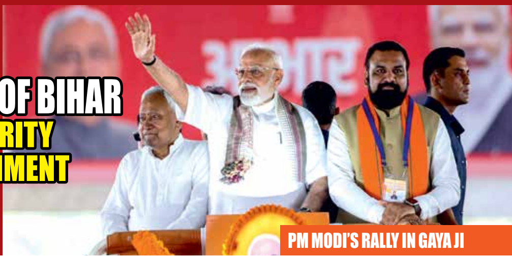
PM MODI'S RALLY IN GAYA JI

A ddressing a massive crowd in Gaya Ji, Bihar, PM Shri Narendra Modi said this land is a land of spirituality and peace. It is the sacred land where Lord Buddha attained enlightenment. The spiritual and cultural heritage of Gaya Ji is very ancient and immensely rich. The people here had wished that this city should not just be called Gaya, but Gaya Ji. I congratulate the Government of Bihar for this decision. I am glad that the double-engine government of Bihar is continuously working for the rapid development of Gaya Ji.