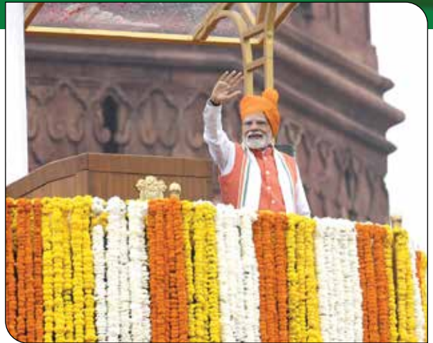
PM Shri Narendra Modi receiving the greetings on the occasion of 79th Independence Day celebrations at Red Fort in Delhi on August 15, 2025