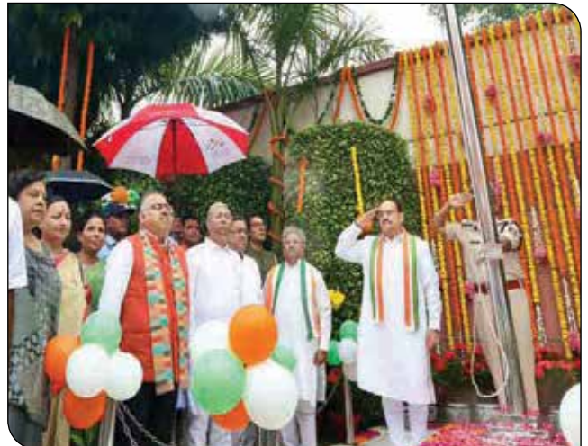
BJP National President and Union Minister Shri JP Nadda hoisting the National Flag on the occasion of 79th Independence Day at BJP HQ, New Delhi on 15 August 2025