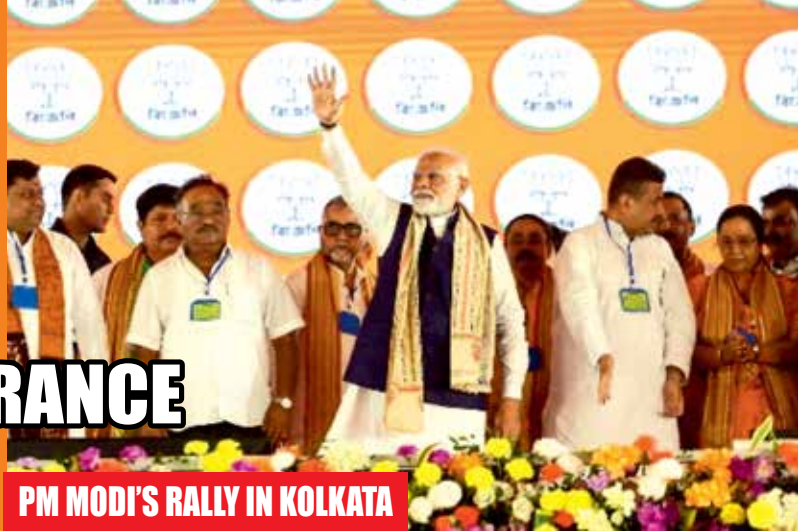
PM MODI'S RALLY IN KOLKATA

PM Shri Narendra Modi addressed an overflowing crowd gathered at a public meeting in Kolkata on 22 August 2025, where he declared that Bengal's rise is essential for India's rise. He firmly reassured, "The BJP government at the Centre has continuously supported Bengal's growth. From highways to railways, Bengal has received three times more funds than under UPA. But the biggest challenge is that funds sent from Delhi are looted by the state government and not spent on people's welfare. Instead, they are siphoned off to TMC cadres," he said.