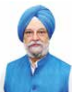
HARDEEP S PURI

I have been privileged to attend 15th August speeches from the time I was in school, but PM Modi's 12th Independence Day speech on Friday was unprecedented and stood out. It unleashed a Brahmastra – Arjun's legendary weapon with no counter – aimed straight at accelerating India's path to Viksit Bharat.