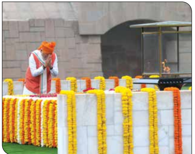
PM Shri Narendra Modi paying homage to Mahatma Gandhi at Rajghat on the occasion of 79th Independence Day, in Delhi on August 15, 2025