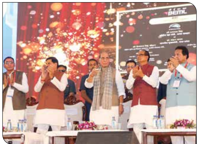
Defence Minister Shri Rajnath Singh along with Union Minister Shri Shivraj Singh Chouhan, MP CM Shri Mohan Yadav and others attending the Bhoomi Poojan of a Rail Manufacturing facility near Bhopal, Madhya Pradesh on 10 August 2025