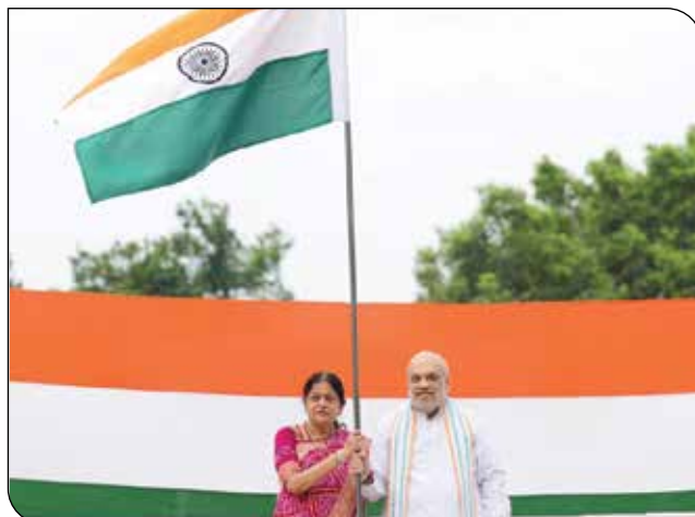
Union Home and Cooperation Minister Shri Amit Shah participates on the nationwide campaign of Har Ghar Tiranga by hoisting a flag at his residence in New Delhi on 13 August 2025