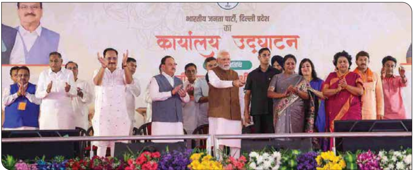
Prime Minister Shri Narendra Modi along with BJP National President and Union Minister Shri J.P. Nadda and other senior leaders inaugurating the newly constructed Delhi BJP State Office in New Delhi on 29 September 2025