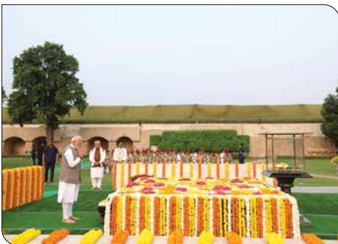
PM Shri Narendra Modi paying floral tributes to Mahatma Gandhi on the occasion of Gandhi Jayanti at Rajghat, in Delhi on October 02, 2025