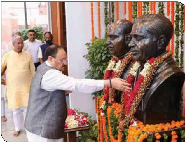
BJP National President and Union Minister Shri J.P. Nadda paying floral tributes to Pt. Deendayal Upadhyaya ji on his Jayanti at BJP HQ, New Delhi on 25 September 2025