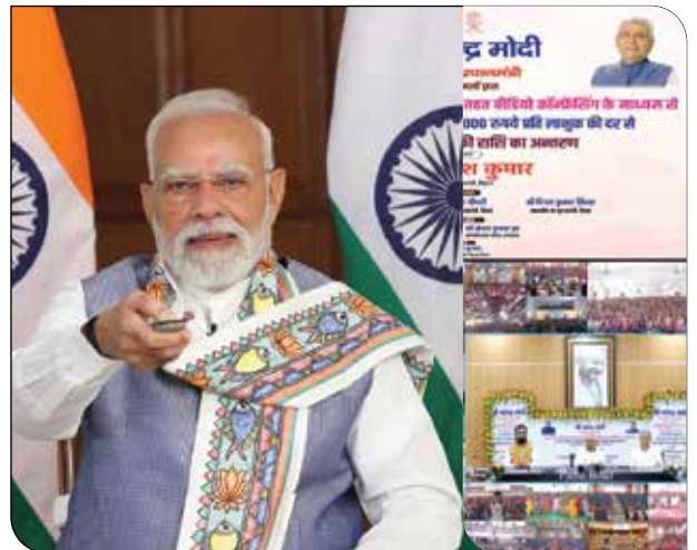
PM Shri Narendra Modi launches Bihar's Mukhyamantri Mahila Rojgar Yojana and interacts with beneficiaries on September 26, 2025