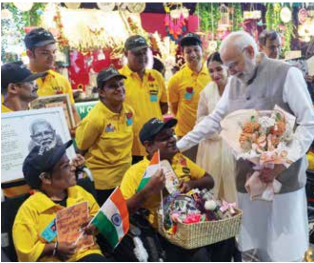
PM Shri Narendra Modi visits an exhibition and interacts with special children during the inauguration of International Airport at Mumbai in Maharashtra on October 08, 2025

Minister remarked that this new airport will connect Maharashtra's farmers to supermarkets in Europe and the Middle East, enabling fresh produce, fruits, vegetables, and fishery products to reach global markets swiftly. He noted that the airport will reduce export costs for nearby small and medium industries, boost investment, and lead to the establishment of new enterprises.