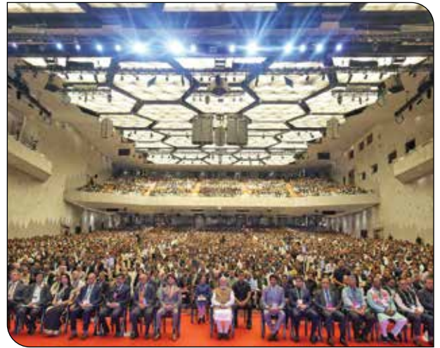
PM Shri Narendra Modi attends the inauguration ceremony of India Mobile Congress 2025 at Yashobhoomi, in Delhi on October 08, 2025