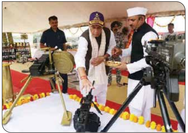
Defence Minister Shri Rajnath Singh performing 'Shastra Puja' on the occasion of Vijayadashami at the Bhuj Military Station in Gujarat on 02 October 2025