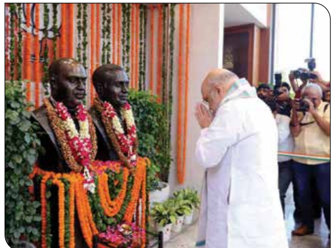
Union Home and Cooperation Minister Shri Amit Shah paying floral tributes to Pt. Deendayal Upadhyaya ji on his Jayanti at BJP HQ, New Delhi on 25 September 2025