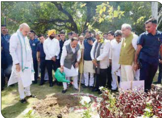
BJP National President & Union Minister Shri J.P. Nadda and Union Home & Cooperation Minister Shri Amit Shah planting saplings under the 'Seva Pakhwada' at BJP HQ, New Delhi on 25 September 2025