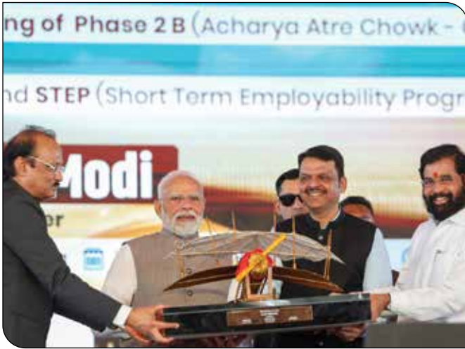
PM Shri Narendra Modi at the inauguration of the Navi Mumbai International Airport and Mumbai Metro Line-3 at Mumbai, in Maharashtra on October 08, 2025