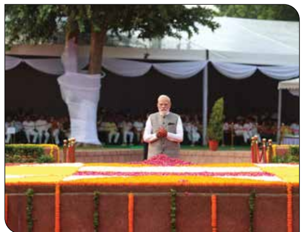
PM Shri Narendra Modi paying floral tributes to the former Prime Minister, Shri Lal Bahadur Shastri on his Jayanti at Vijay Ghat, in Delhi on October 02, 2025