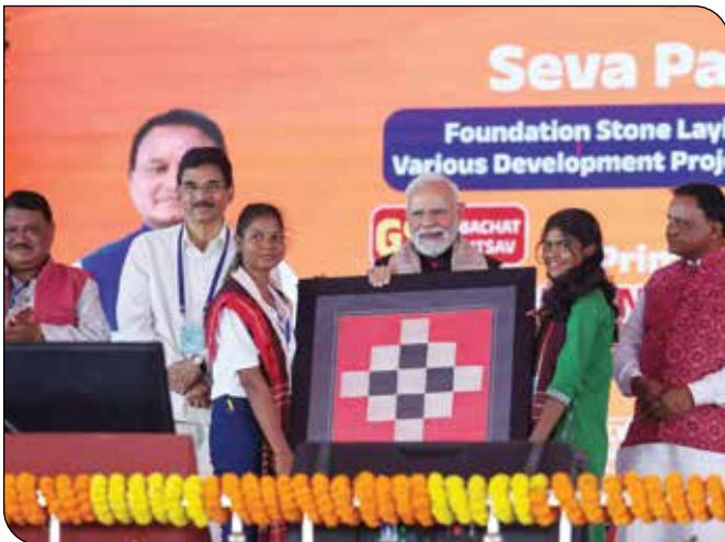
PM Shri Narendra Modi launches development works over Rs. 50,000 crore in Jharsuguda, Odisha on 27 September 2025