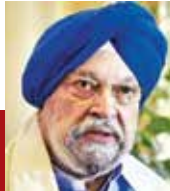
HARDEEP SINGH PURI

The contrast with the world is striking. China's population is ageing rapidly, its median age now past forty, while India's remains under twenty-nine. Two-thirds of our people are below thirty-five. That youthful energy, harnessed through skilling, education and