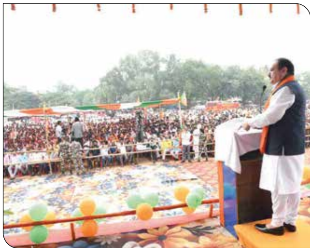
BJP National President and Union Minister Shri J.P. Nadda addressing huge public rallies in Goh (Aurangabad) & Patepur (Vaishali) Bihar on 23 October 2025