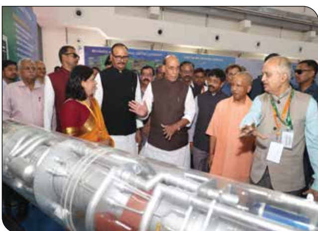
Defence Minister Shri Rajnath Singh along with UP CM Yogi Adityanath flagging-off the first batch of BrahMos missiles manufactured at the BrahMos Integration and Testing Facility Centre in Lucknow, UP on 18 October 2025