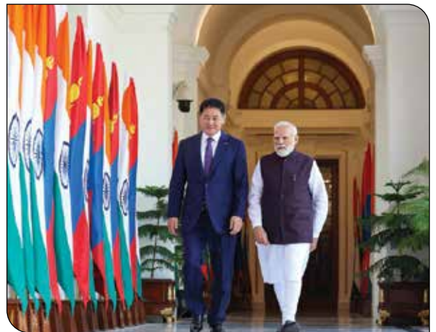
PM Shri Narendra Modi meets the President of Mongolia, Mr. Khurelsukh Ukhnaa at Hyderabad House in New Delhi on October 14, 2025