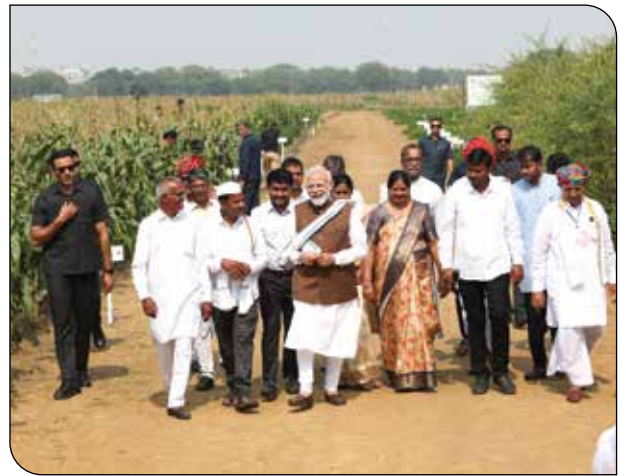
PM Shri Narendra Modi interacting with farmers engaged in pulses cultivation on the sidelines of the special Krishi programme in New Delhi on October 11, 2025