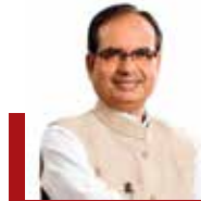
SHIVRAJ SINGH CHOUHAN

Keeping the interests of farmers and the common people foremost, the government has made sweeping reductions in GST rates - reforms that will energise India's agricultural system and power the progress of farmers. These are not abstract changes in policy; they touch the very soil farmers till every day. Over 10 crore small and marginal farmers will benefit directly. Earlier, agricultural equipment attracted GST rates as high as 18%; now it has been slashed to just 5%, ensuring direct savings