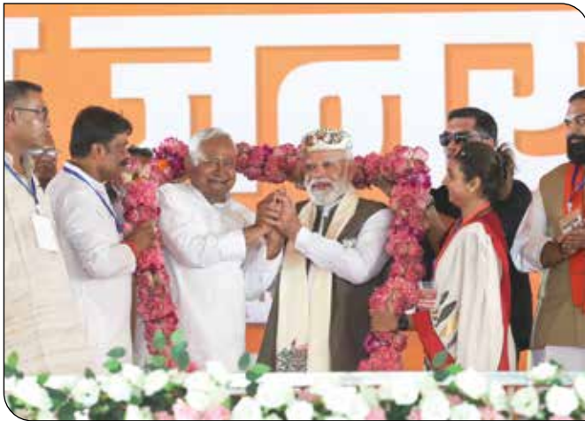
PM Shri Narendra Modi and Bihar CM Shri Nitish Kumar at the massive rallies in Samastipur and Begusarai, Bihar on October 24, 2025