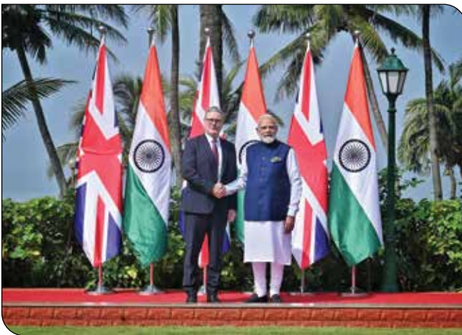
PM Shri Narendra Modi receives the Prime Minister of the United Kingdom Mr. Keir Starmer in Mumbai, Maharashtra on October 09, 2025