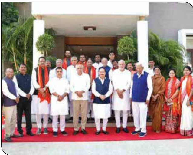
BJP National President and Union Minister Shri J.P. Nadda along with Gujarat CM Shri Bhupendra Rajnikant Patel and others at Gujarat Cabinet Swearing-in ceremony in Gandhinagar on 17 October 2025