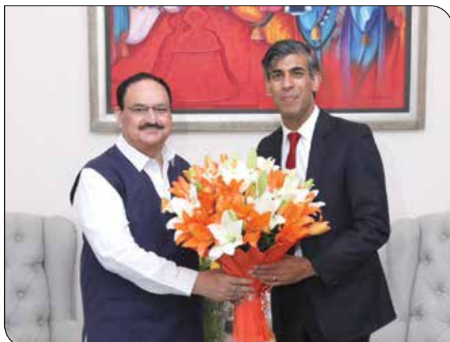
BJP National President and Union Minister Shri J.P. Nadda meets with former UK Prime Minister Mr. Rishi Sunak in New Delhi under the 'Know BJP' initiative on 16 October 2025