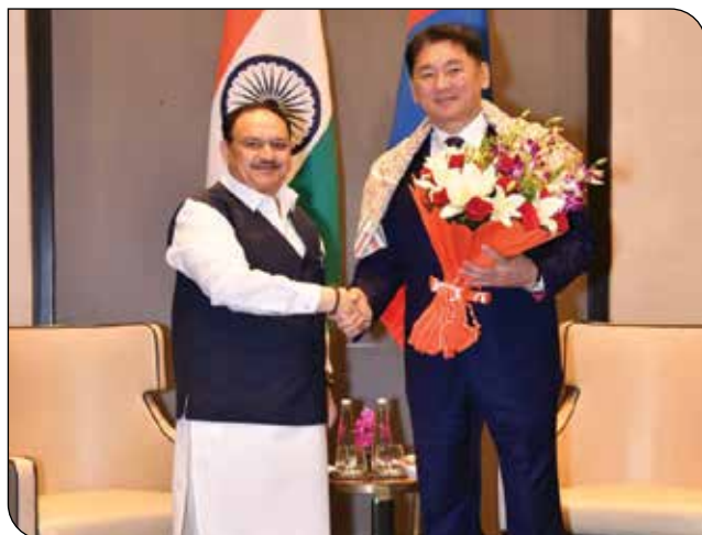
BJP National President and Union Minister Shri J.P. Nadda meets President of Mongolia Mr. Khurelsukh Ukhnaa in New Delhi under the 'Know BJP' initiative on 14 October 2025