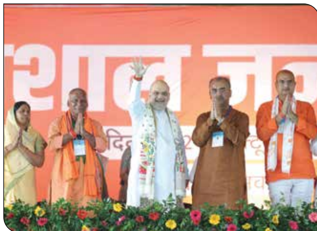
Union Home and Cooperation Minister Shri Amit Shah addressing huge public rallies in Siwan and Buxar in Bihar on 24 October 2025