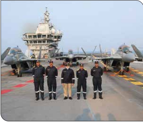
PM Shri Narendra Modi celebrates Diwali with the armed forces personnel on board the INS Vikrant on October 20, 2025